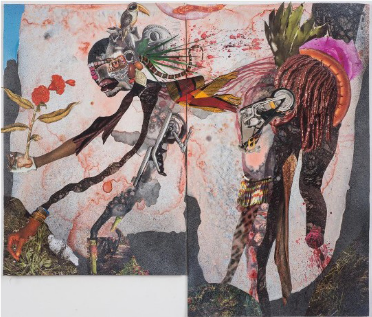
Fig. 6. Wangechi Mutu, The Last Grower , 2015, combining materials (collage-painting) on two asymmetric linoleum canvases. 7.66 * 6.75 cm. Source: Holzwarth, 2003, 182.

At first glance, we feel that the right eye is the same as the snake's head, but as we observe more closely, we can see that Mutu used the collage of the image of a roaring tiger instead of the eye. A red snake is also moving above the figure's head and in the background. A collage of a bird (a parrot belonging to the tropics) can be seen on the head of the figure. In this work, Mutu has also used mechanical devices in two parts of the collage, and the location of these collages refers to the female sexual organs. The background has been painted in most parts using the