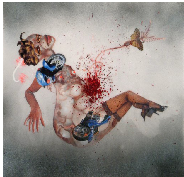
Fig. 2. Wangechi Mutu, 'Untitled', 2004, collage and painting on velvet, 47.5 * 47.

In this work (Fig. 2), Wangechi portrays the body