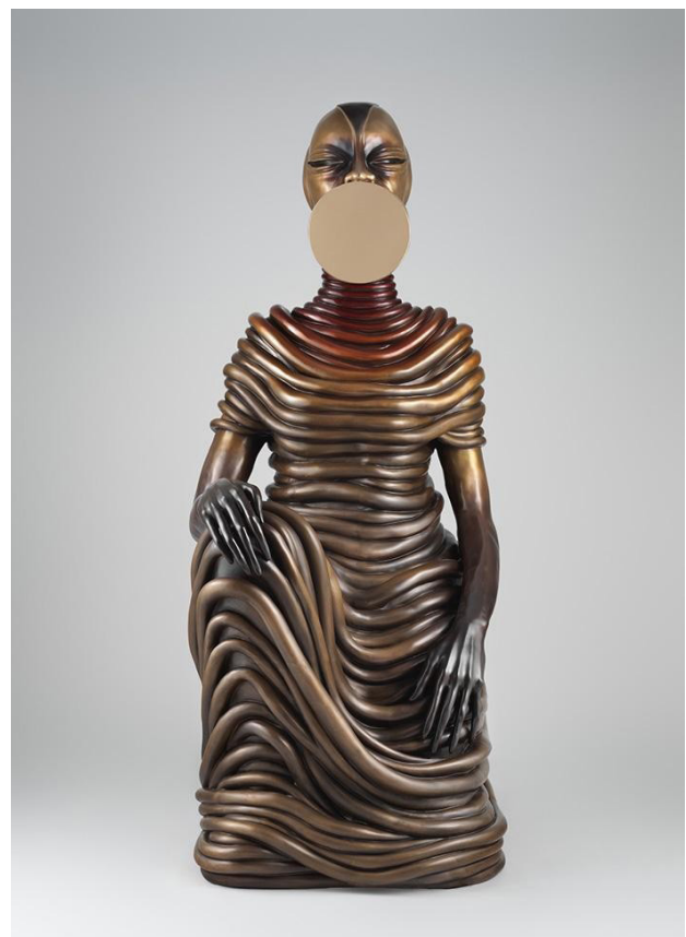
Fig. 1. Wangechi Mutu, Seated, Bronze, Metropolitan Museum, 201*85.1 *113.

But in fact, contemporary art in Africa was created through a kind of bricolage process on the structures and scenarios that came before it, in which the older, pre-colonial and colonial genres of African art flourished. It is in this structural sense, and in the habits and approaches of artists to the production of art—not in commitment to a particular style, tool, technique, or subject spectrum—that this art can be recognized as "African art" (Kasfir, 2007, 13). Wangechi Mutu (1972) is a contemporary African (Kenyan) artist who moved from Africa to New York in the 1990s. In 1996, he received his BFA from the Cooper Association, as well as his Master of Arts in Sculpture from Yale University in 2000. She moved from Africa to New York in the 1990s and has lived and worked in Brooklyn ever since. Mutu's works can be divided into the categories of collage, sculpture 1 (Fig. 1), installation, and video art 2 . Her works have been exhibited around the world; Mutu's