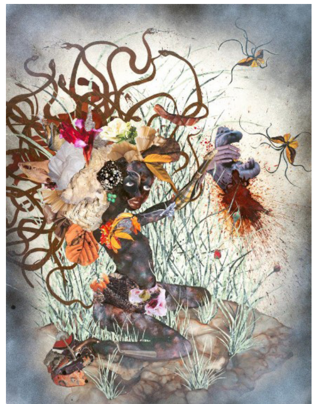
Fig. 5. Wangechi Mutu, The Bride Who Married a Camel's Head , 2009, Composition of Materials and Collage on Mylar, 1066*76.2 cm 3 .

This work (Fig. 5) by Mutu shows the half-naked figure of a black woman. The bride’s head is decorated with dark snakes and a bouquet. It seems that this is an exaggerated set of decorations, hats, or crowns for the bride. Below the feet of the figure are tall, needle-shaped green grasses. In the background,