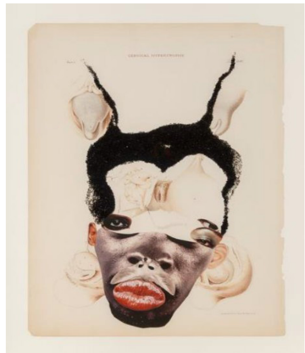
Fig. 3. Wangechi Mutu, cervical hypertrophy, 2005, from the Histology of the Different Classes of Uterine Tumors collection (2004-2005), 45.7 x 32.4.

The collection "Histology of the Different Classes of Uterine Tumors" (Fig. 3) contains twelve portraits with a painting-collage technique, which focuses on gender, female organs, and diseases. Mutu created this portrait, called "cervical hypertrophy," from a collage of illustrations from an old medical textbook. The collage pieces in this work are a collection of uncoordinated body parts (portraits).