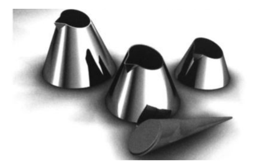
Fig. 3. Modern Design of a Turkish Coffee Cezve, Designer: Aykut Erol, 2010.

use indigenous materials and specific production methods. This can be easily seen in the designs and design studies of African countries in the last decade. This identification based on the use of indigenous materials and manufacturing methods can be found in design-oriented businesses in South Africa, Nigeria, Zimbabwe, and Ghana, which focus on everyday usable products that are made of natural and indigenous fibers, such as bamboo, ceramics, and African plant fibers. (Gimeno-Martínez, 2013, 5-11; Lange & Eeden, 2016, 64-73). Distinctive African identities are easily observed in the face of such products.