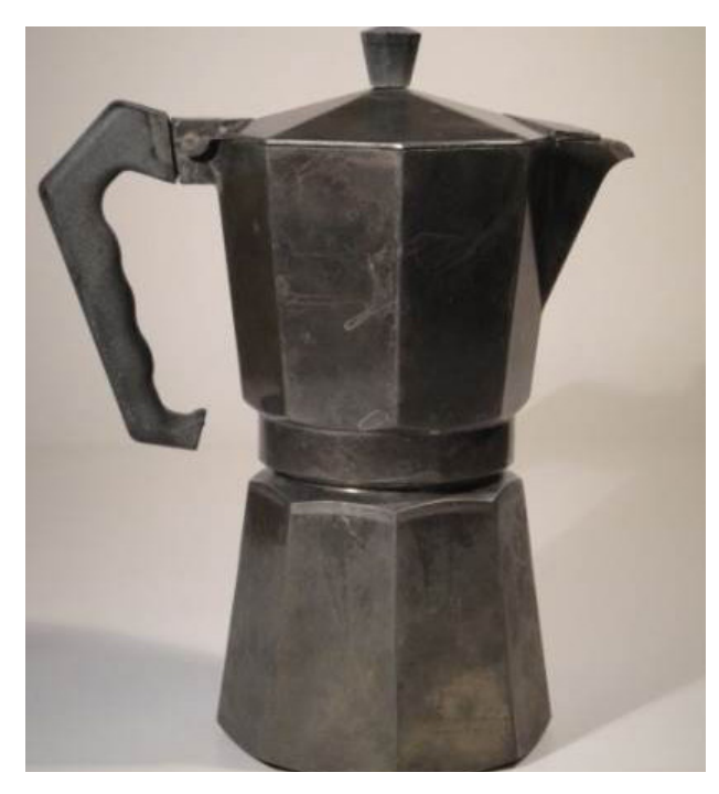
Fig. 2. Moka Express machine, designed by Alfonso and Renato Bialetti - 1933: Reminiscent of Italian identity in the form of Italian design.

became common, but in recent years has become doubly important in light of the theory of product mediation; product design is the mediator in the transfer of diverse information from the community that produces and consumes it. Part of this material information is about the ability to