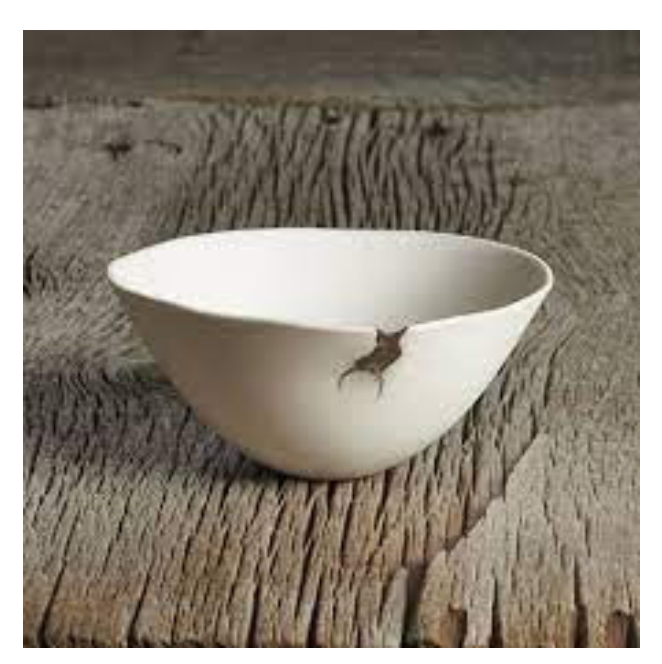
Fig. 4. The Wabi-Sabi phenomenon versus the "Perfectness" concept of Western design, a bowl with a Japanese design.

Bagh-e Nazar #8 M. Khodashenas & Y Azhand