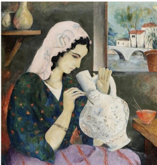
Fig. 3. Turgut Zaeem, Chinese Decoration Eden Girl 9 , oil on canvas, size: 116 by 100 cm.

It has already been said that the influence of Western art on traditional Turkish painting was first seen in the works of Levni, the Ottoman painter of the Tulip period in the eighteenth century. By adding the features of Western art to traditional painting, he broke with the usual rules of painting for the first time, but never completely followed Western painting (Blair & Bloom, 2017, 628) (Fig. 4). After that, with the advancement of technology during the nineteenth and twentieth centuries and the use of printing and photography, and the beginning of the modernization process, this art lost its popularity and remained abandoned for a long time, until the beginning of 2000, a new phase began. The opening of the 'Istanbul Museum of Modern Art' 10 in 2004 played an important role in the revival of traditional Turkish art, which had been forgotten for years (Ozbilge, 2016, 2). Earlier in the 1960s, Professor Süheyl Ünver 11 , with his research on traditional Turkish art, made a significant impact on this process. Since the late Ottoman period, the Turkish curriculum has been Western-style, and universities have no plans to teach traditional arts in their curriculum. To fill this gap, Professor Ünver began to hold training