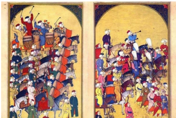
Fig. 4. Levnî Abdülcelil Çelebi, Surname-i Vehbi (folio 172a on the left and 171b on the right), with the influence of Western art in the figures, the treasure of Topkapı Palace.

was used not only in painting or illustration but also in different artistic fields such as installation, animation, cinema, etc.