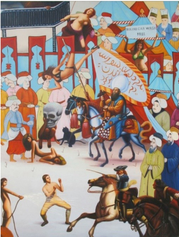
Fig. 10. Gazi Sansoy, a collection of pop miniatures, oil on canvas, the structure of a traditional Ottoman painting with pictorial elements of the New World, 80 by 60 cm, 2014.

field. These artists were influenced by traditional painting at a time when Republican policymakers