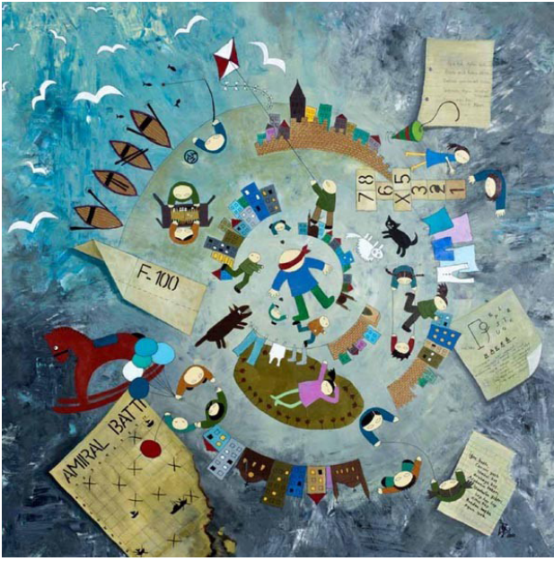
Fig. 9. Şiir Özbilge, Constantinople, from a collection of Istanbul short stories, illustrations influenced by the structure of Ottoman painting art.