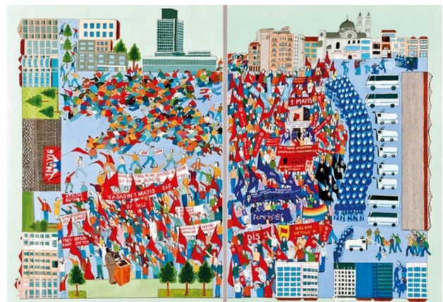
Fig. 7. Canan Şenol, May, Painting, Photography and Ink on Special Paper, 100 x 140 cm, 2010.