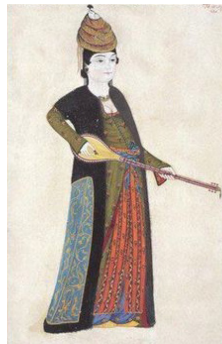
Fig. 1. Abdullah Buhari, Sazende , 18th Century, Painting Influenced by Tulip Figures, Istanbul University Museum.

As mentioned earlier, Westernization began as a process of achieving modernity in court circles and gradually penetrated other social institutions. The new tendency of courtiers to Western art marginalized traditional art. In the military schools of this period, for the first time painting was included in the lessons, the main purpose of which was to teach technical skills to young officers to create topographic designs and technical drawings (Marie Baldwin, 2011,43). The establishment