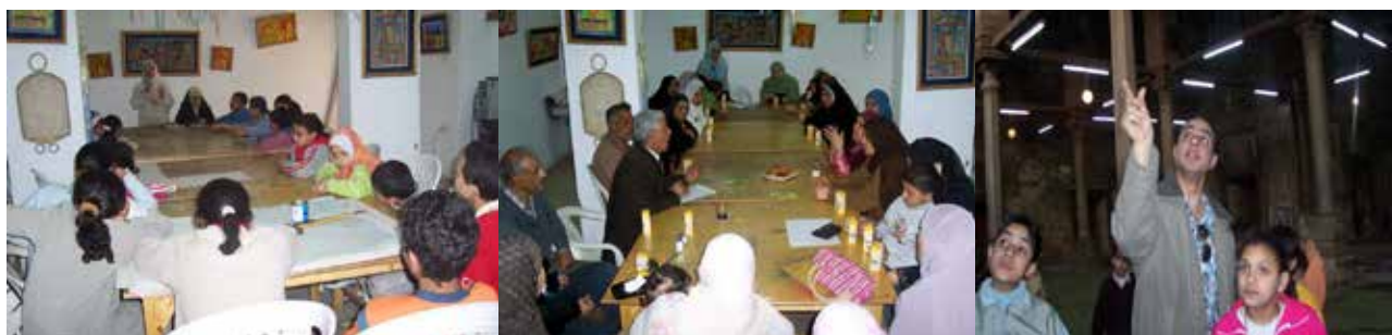
Fig. 6. Authorities are explaining conservation measures to locals, children and students.