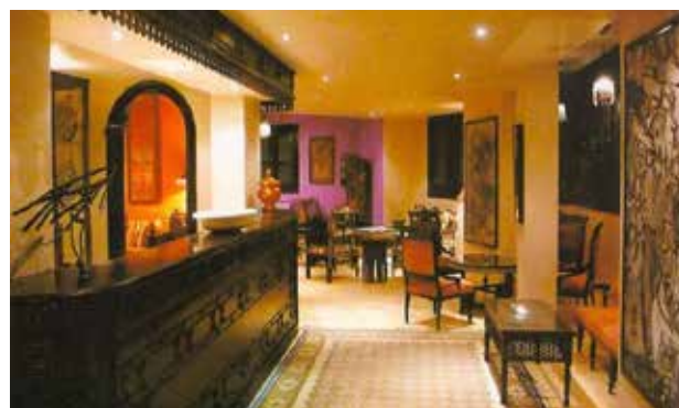
Fig. 5. Tourist accommodation on Al-Moez Street.

This paper discussed the authenticity of the heritage sites from two perspectives: principles of