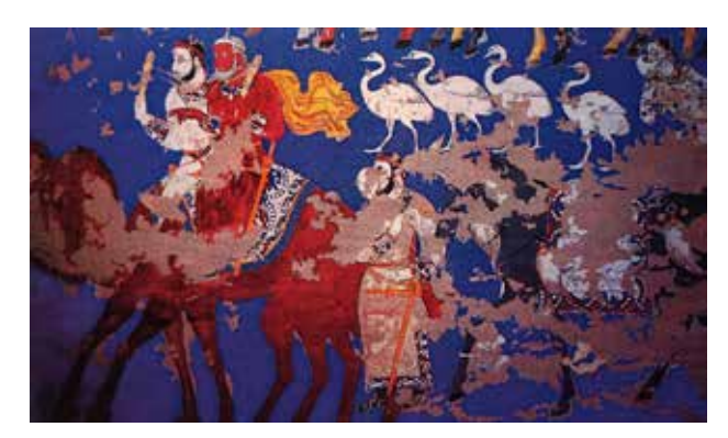
Fig. 1. Part of the Sogdian Wall Painting, Samarkand, first half of the seventh century Choghani envoys to the Samarkand kingdom.

of the dynamic economy and relatively free Sogadian social and political structure can be found in a variety of graffiti themes. "The Sogadian painting has a great variety. Predominantly, it can be divided into religious, epic, historical, regular and folk groups depending on the subject " (Pakbaz, 2017, 39). In addition to the variety of mural themes, the types of themes that are most commonly used in this global and everyday world can also be a reflection of the structure of Sogadian economics and society.