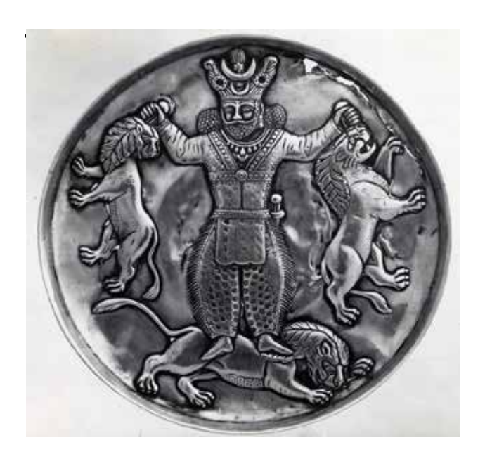
Fig. 2. Sasanian commander depicted as an epic hero.