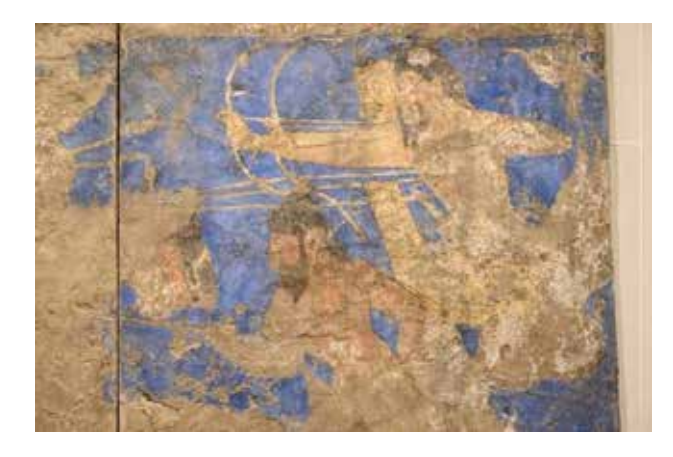
Fig. 3. Part of the Sogdian murals (Rostam's Seven Labors), Panjakent