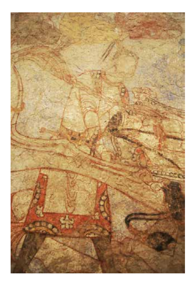
Fig.7. Sogadian Cloth Inspired by Sasanian textile, Panjakent.