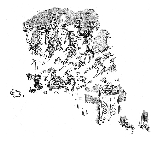
Fig. 8. Sogadian Ladies' Showtimes, Panjakent.

Sogadians were part of the Achaemenid realm and had encountered Iranian art many years before the Sassanids; Persepolis carvings shows Sogadian they were not only familiar with Iranian art at the time, but also familiar with the social and cultural structure of the Iranian people and had a close relationship with the Iranians.