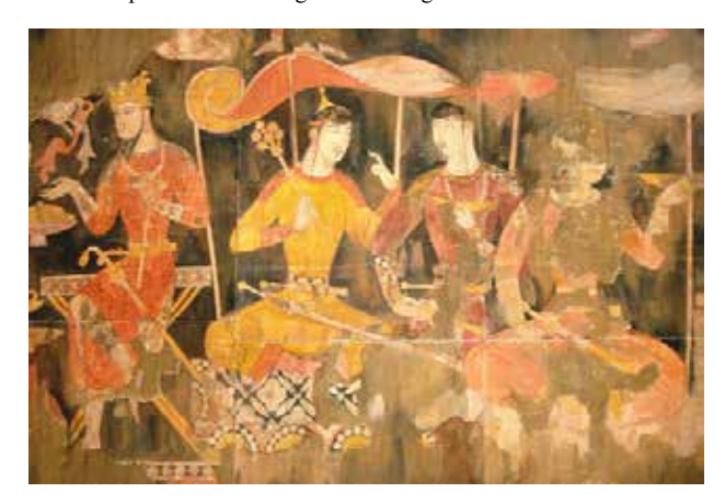
Fig 4. Part of a Sogdian mural depicting a royal ceremony.