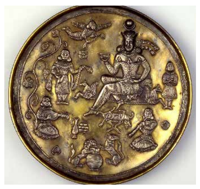
Fig. 5. How the Sassanid King was depicted among other people.

lives (Azarpey, 2018, 46). In general, in the Sogadian mural, the king is of equal size to the others at the grand ceremony, as shown in Fig. 4. In Sassanian murals not only the king overcame other emperors but also he is larger than the others (Fig. 5).