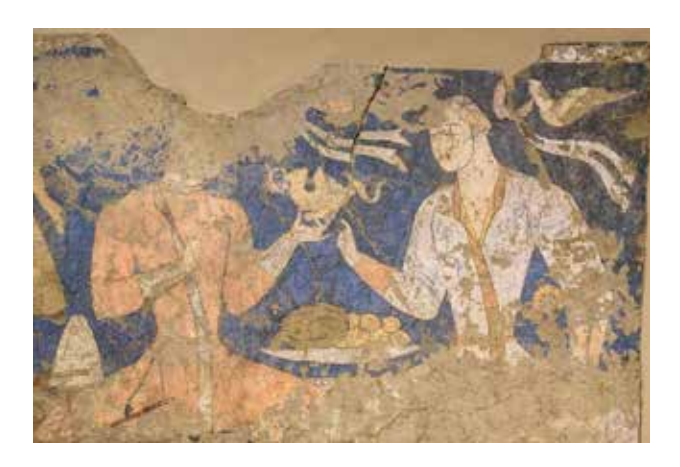
Fig. 6. A section of the mural depicting a scene from a banquet, Panjakent<sup>3</sup>.

In studying the arts and culture of many lands related to Iran, one can see the interplay of many cultural and artistic traditions which is the most important visual heritage that remains in the geographical range of Soghd in Central Asia. Thus, as can be seen in Table 2, examining the effects of Sasanian paintings on Sogadians, plays an important role in recognizing Sogadian visual culture and among them, the murals depicted on brick architecture in the cities of Transoxina, are the most important artistic expression of Sogadian culture (Shojaee Mehr, 2016, 145).