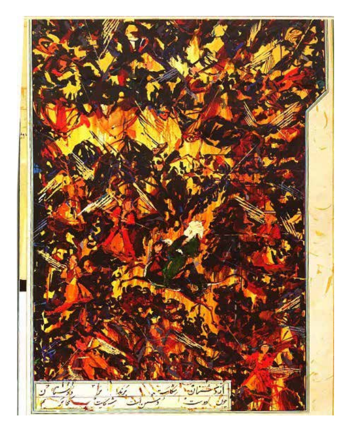
Fig. 2. Untitled, Shahryar Ahmadi, collection of ascension, 2010, acrylic on canvas.