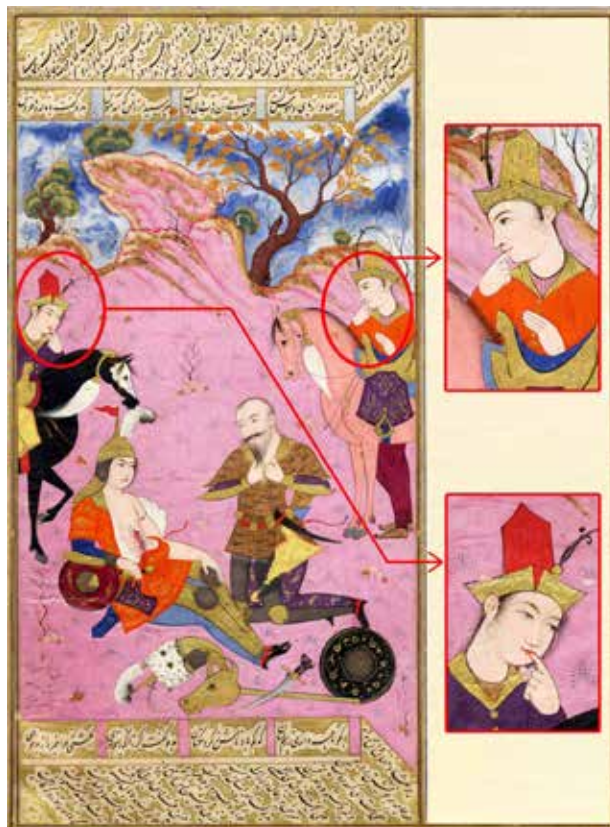
Fig. 4. Rostam and Sohrab, from Ferdowsi’s Shahnameh , Mo’en Mosavver, Isfahan.