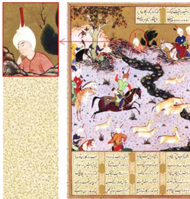
Fig. 3. Hunting of two zebras with one arrow by Bahram Gor, Shahnameh of Shah Tahmasp. Source: Ferdowsi, 2011, 177.

are many examples of the use of this gesture in Iranian painting since the Fourteenth Century. This is rooted in the profound impact of Iranian literature