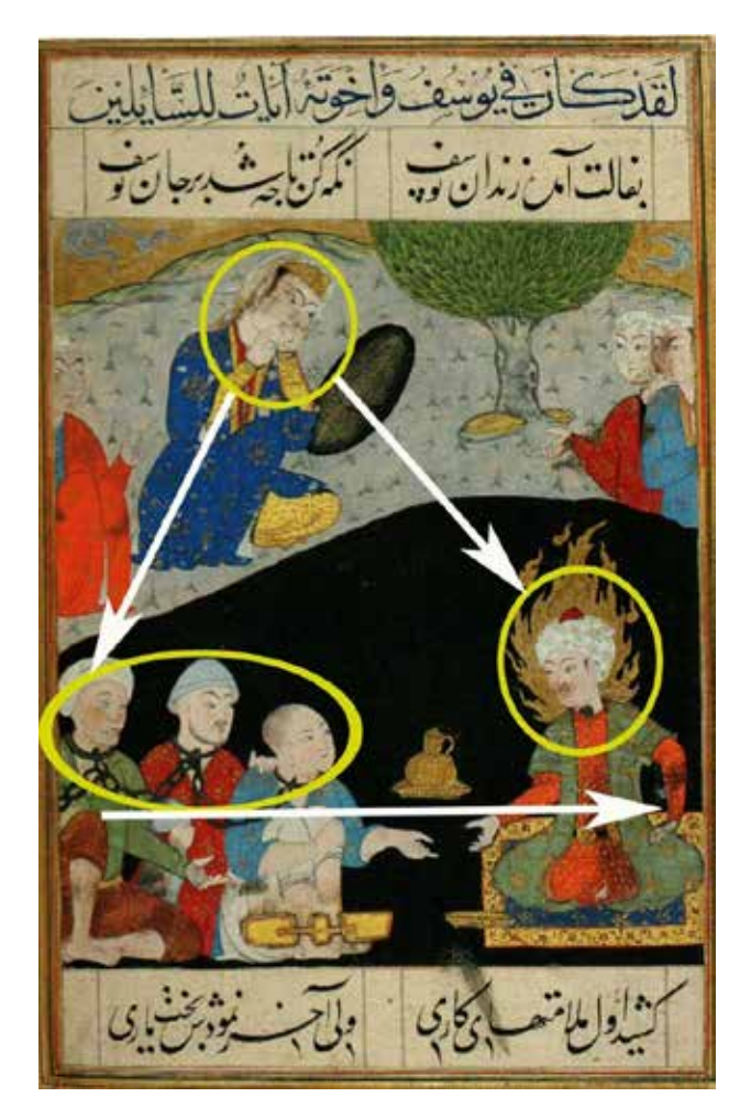
Fig.1. Miniature of Joseph in prison, from Safavid Falnama, Topkqapi museum, 49.5 *36 cm. Watercolor and gold on paper

a suspension; however, this suspension in the act of achieving a high status for the actor is indeed a type of divine support of the Prophet (Table1).