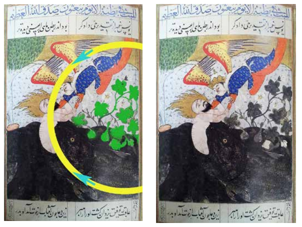
Fig.3. Spacing of Jonah and the Fish miniature, from Safavid falnama, Toopkapi museum, Source: Farhad, 2010.

Table 2. The same location of captivity and release in both plans of the miniature to the two main characters, Joseph &. Source: authors, 2018.