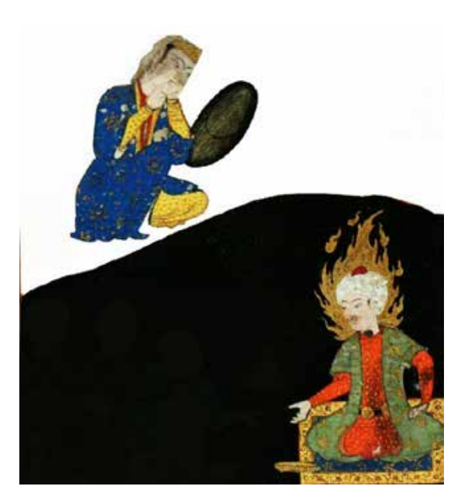
Fig. 2. Discourse coloring of Joseph in prison, from the Safavid Falnama, Topkapi museum, 36*49.5 cm, watercolor and gold on the paper.

revealed by decreasing the extensive and increasing the intensive (emotional-sensual, perceptual); (Shoeyri, 2013: 80).