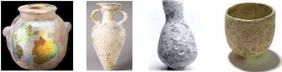
Fig. 4. Mesopotamian and Sassanid Ancient glass utensils with conservation of layers resulting from superficial erosion.