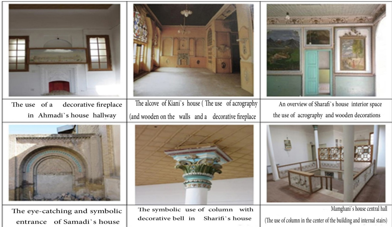
Fig. 2. Developments studied interior design and decorating the house.

the interior spaces, especially in the alcove and the main hall. Picture 2 depicts some decorations of the houses understudy.