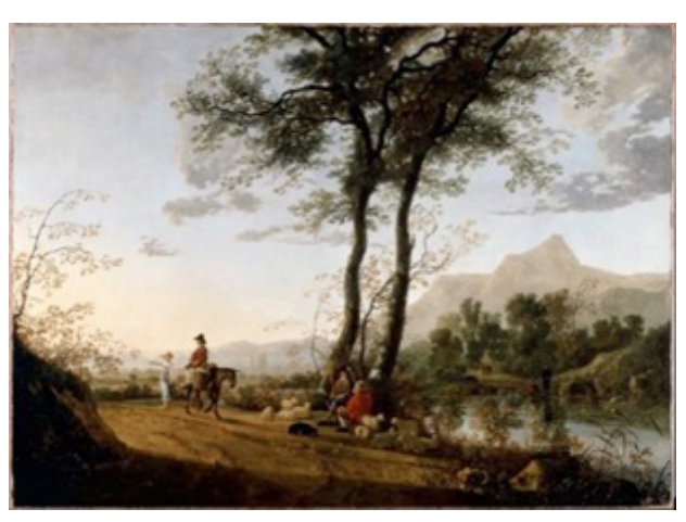
Fig. 2. A Road Near a River by Aelbert Cuyp (1660).