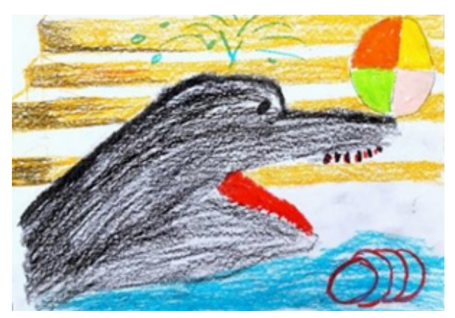
Fig. 7. Turning the shadow of the hand into a living being, the work of an nine-year-old child in light and shadow practice

along with the achievement of natural mental and physical growth conditions along with a natural process of developing cognitive abilities (Ahmadian, 2007, 39-40). This interpretation of Parson's theory is in line with the current research, because in this research, the tested children who were in the age group of 7 to 9 years should be in stage one or two according to the age group, and the same case should be repeated in the post-test, if the effect of art education (which was also mentioned in the above interpretation of Parsons theory of aesthetic development), causes the perceptual qualities to improve.