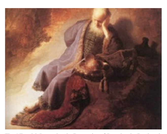
Fig. 1.Eremiah Lamenting the Destruction of Jerusalem by Rembrandt (1630).