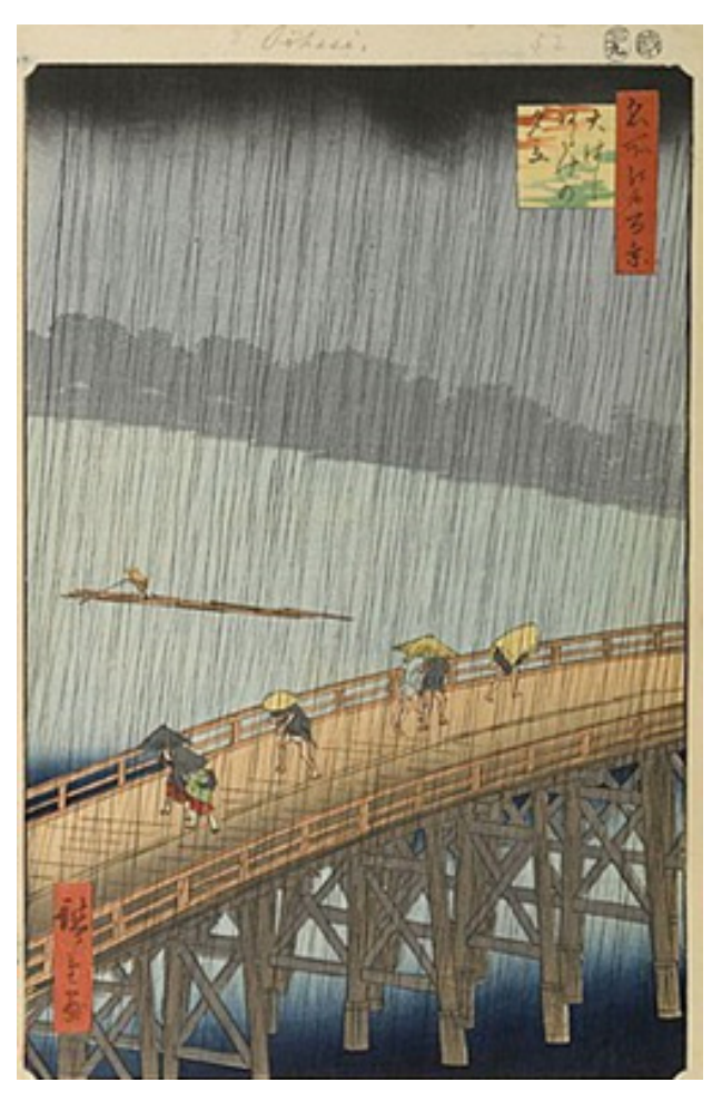
Fig. 4. Sudden Shower over Shin-Ōhashi bridge and Atake by Andō Hiroshige (1857)