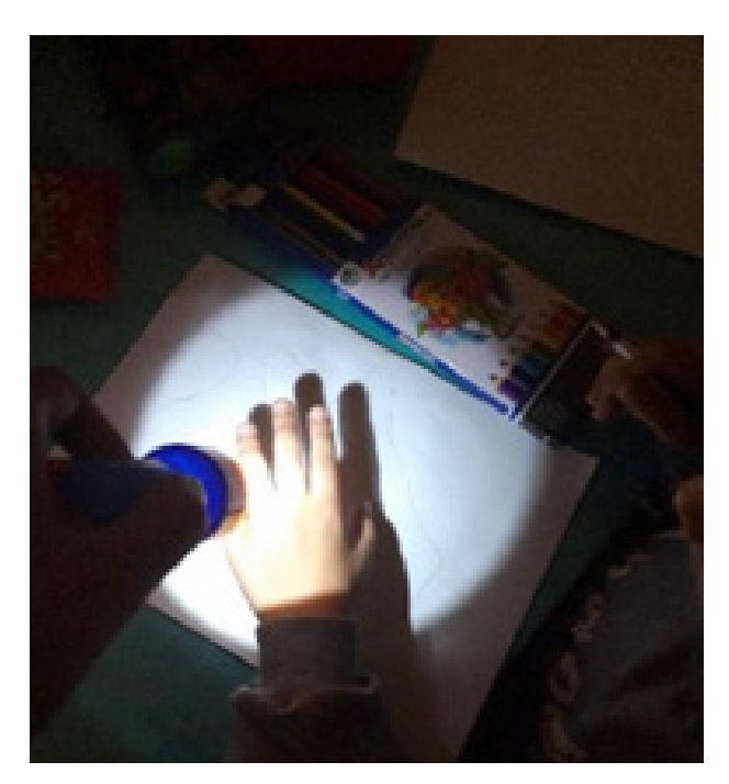
Fig. 5. A seven-year-old child practicing light and shadow