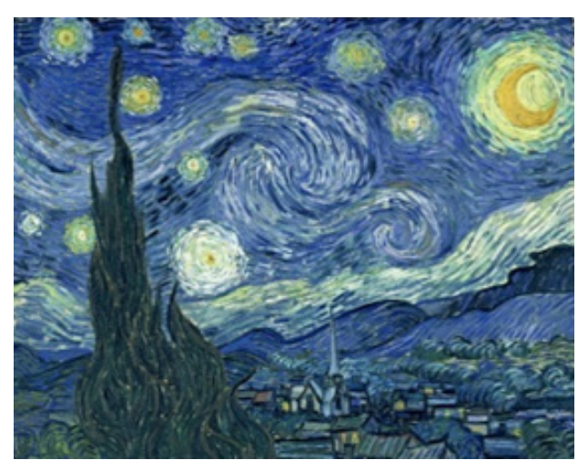
Fig. 3. Starry Night by Vincent Van Gogh (1889).

art (here, painting) parallel to the age development, hard effort to understand different types of works,