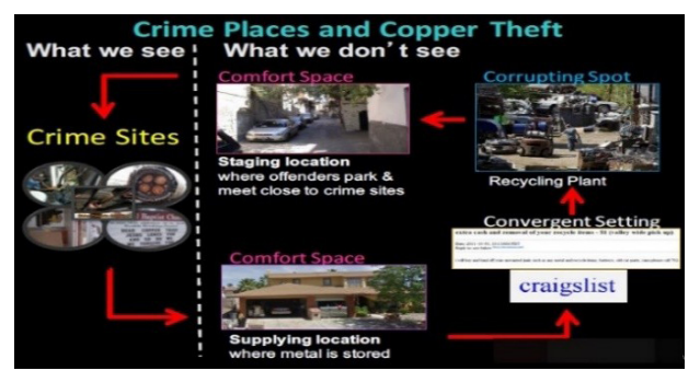
Fig. 4. Graphic representation of the connections of the "objective crime place networks" required in the occurrence of crime.

In addition to the opinions and theories of criminology of place, place in the opinions and theories of place-based crime prevention field has also grown significantly, especially from the perspective of the concept of "place management", and the main origin of the concept of "place management" returns to the theories and approaches of crime prevention (Carrabine et al., 2009, 138). In this context, since the 1990s, different approaches to "crime prevention" have been born in the criminology literature, which can be at least