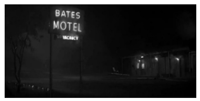
Fig. 1. Cheap motel, the scene of the murder in the valuable classic film "Psycho" by Alfred Hitchcock.

In the literature of interdisciplinary criminology texts, "crime" is usually considered a complex phenomenon (Brantingham & Brantingham, 2010, 279; Muncie, 1996, 59-60) and therefore requires a theory to understand and explain (Tilley, 2009, 3).