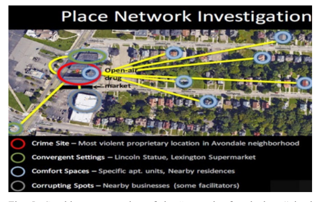
Fig. 5. Graphic representation of the "network of real places" in the occurrence of crime.