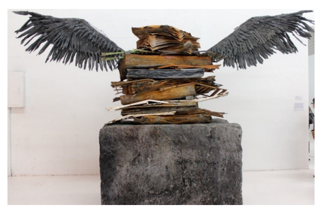
Fig. 1. Anselm Kiefer, Bird Tongue, Metal, Wood, Resin and Acrylic Oil Layer, 1989.

The element of books can be found in the works of Kiefer. Perhaps, this utilization is a metaphor for the Bible or a general concept of culture and consciousness for man. He generally makes his books out of the lead, which may be ambiguous in the sense of weight and flexibility at the same time. Kiefer lead books have also been used in a volume work called "Birds' Language"(Fig. 1).