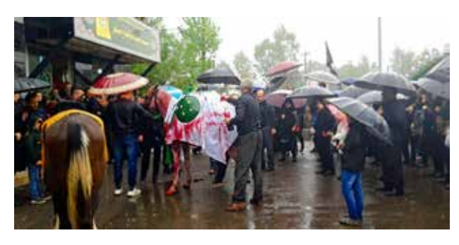
Fig. 3. Waiting for the Ta'ziyeh in the cemetery.

Facing the enemies of Imam Hussein (AS), on the other hand, also fosters a sense of disgust and hatred that people feel towards them. As spectators are suddenly confronted so many signs, they feel a compressed or contracted presence of signs, which shatters the graveyard under the gaze of the spectators and takes them away from that place and time and to a new time and place (the Battle of Karbala). According to Eric Landowski, it seems that a special place is formed which has an added value due to new signs (originating from the building) (Shairi, 2013, 227). The surprise caused by facing the set of signs turns the cemetery into a spiral place that astonishes the spectators and they follow the signs, events and the path of these new moments with astonishment. The spiral places can collapse after a while, and as the performers leave the building, the spirals will soon break down and the spectator will feel his presence in the cemetery more.