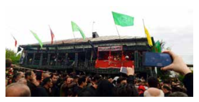
Fig.6. House of Ayatollah Ziaberi.

The emergence of icon to hyper-icon development and the transformation of place in the house of Ayatollah Ziaberi can also be seen, and now, according to the narration of mobile Ta'ziyeh, there is a semiotic rupture in this house. In fact, the house finds a semantic role due to the new narration (Ibn Ziad's court), and the spectator is confronted with a new and old "narrative place" that he did not face before performing the Ta'ziyeh and the mentioned building was known as the house of Ayatollah Ziaberi and one of the national monuments of Iran. In fact, this building had once been upgraded to a national monument with architectural features of the Qajar period (1789-1925), but now, due to the performance of Ta'ziyeh, a new semiotization process appears again in the place of Ayatollah Ziaberi's house and the historical building of Ziaber