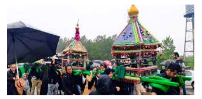
Fig.4. Participation and presence of spectators to assist in performing the mobile Ta'ziyeh of Ziaber. Source: authors archive<sup>3</sup>.

The main tools of narration are not words and poems, which are sometimes not audible. The insignificance of words stems from the fact that the spectators are in a position between space and place, and in this situation, the perception of the play is done not through cognitive powers but rather through the "presence" of the spectators. The play engages the "Self" of the audience and that "self" finds its way into a place of space and abstraction. According to Chelkowski (1991, 220), the spectators of Ta'ziyeh are present both in the place of