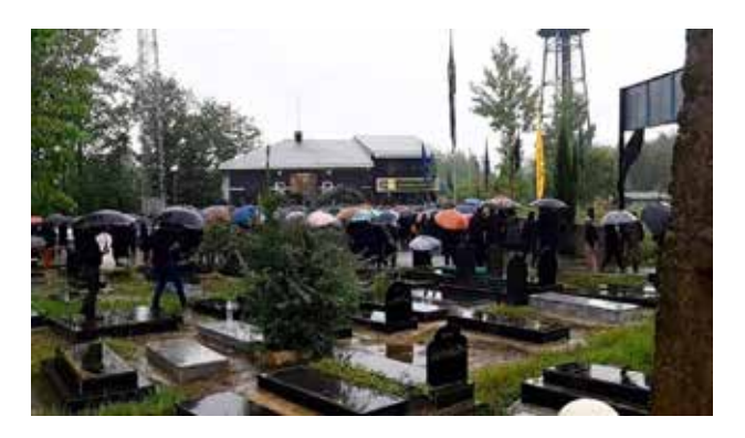
Fig. 2. The audience outside the Hosseinieh are waiting for the Ta'ziyeh performers to leave the building.

As the performers leave the Hosseinieh building, for the first time the audience (subject) witness a set of signs including characters, horses, and tools such as helmets and swords, tents, etc., which have no do not belong to the present and remind them of Imam Hussein (AS) and a certain period of history.