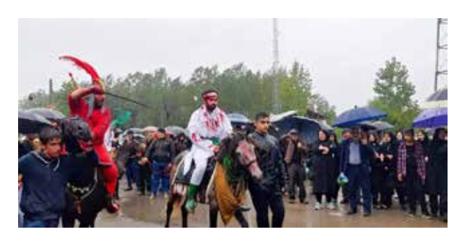
Fig.5. Participation of spectators in mobile Ta'ziyeh and following it on the main street of the city.

Ta'ziyeh and in the desert of Karbala, and at the same time in the present and in the past.