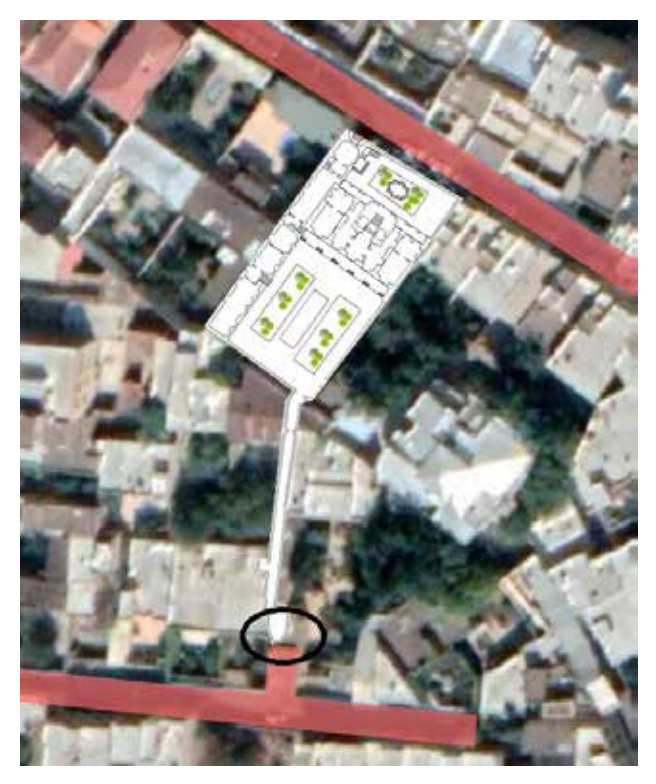
Fig. 1. Plan of Sharbat-Oqli House and the location of the façade as the case study in this article.