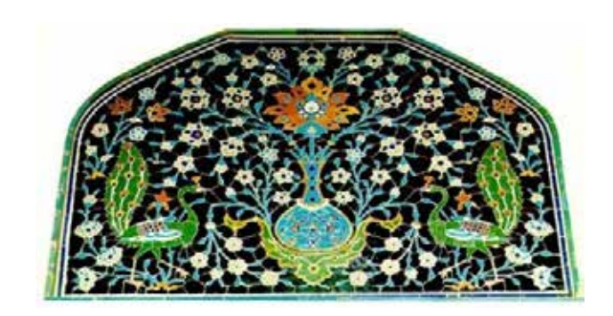
Fig.7. The motif of Two peacocks and tree of life, Portal of Imam Mosque in Isfahan, Safavid period.

Obviously, the iconological interpretation of the molding on the façade of Sharbat-Oqli House is