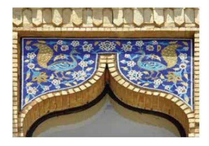
Fig. 9. The motif of two peacocks and tree of life, in a part of the façade of Artists House of Isfahan, which was built at late Qajar period as a house.