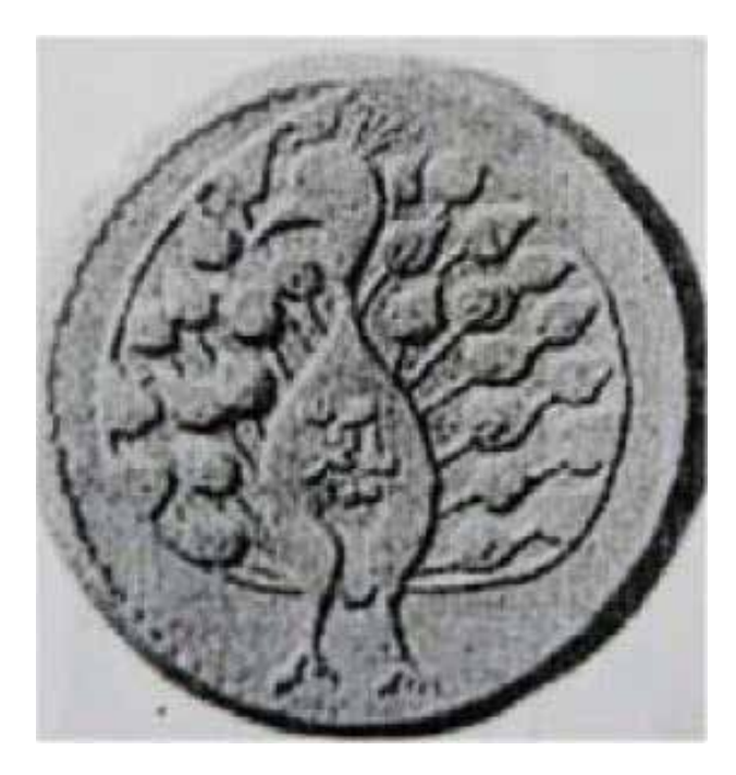
Fig. 8. Gold coins related to the Qajar period.