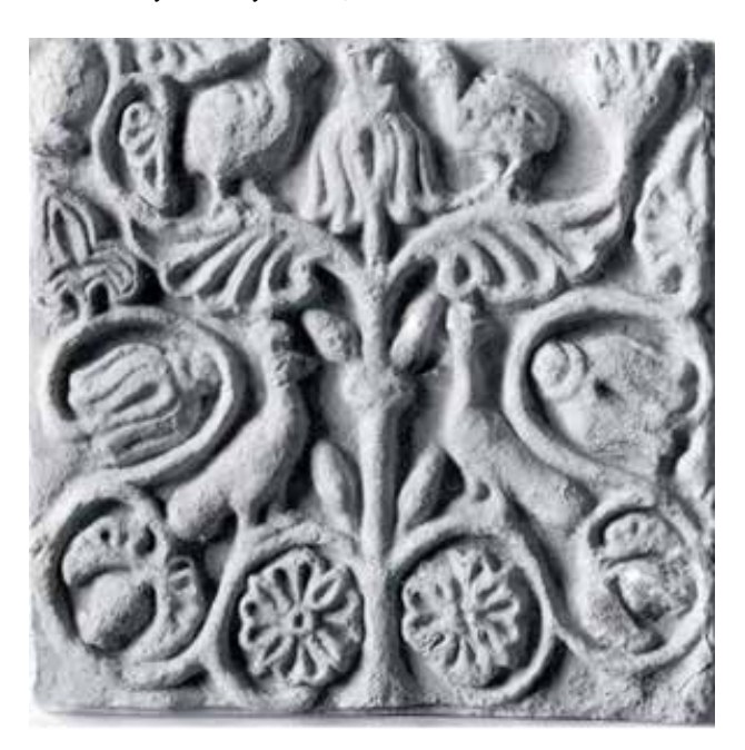
Fig.6.The motif of tree of life and peacocks on the Ctesiphon relief, Sassanid Era, Metropolitan Museum.

and Arabs have taken it to far East (Pourkhaleghi Chatroodi, 2002, 96), In the culture of ancient Persia, snake (dragon) was known as a symbol of the devil which sought to dominate the tree of life, an occurrence that could lead to disasters such a drought. Accordingly, in images involving the tree of life, some guardians are appointed to protect the tree and its fruits, which are usually animals such as mountain