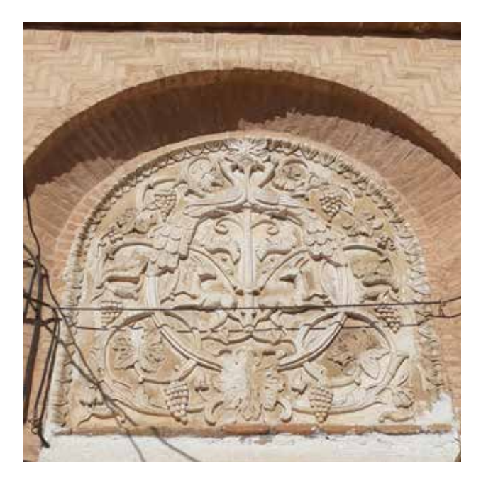
Fig. 5. Plaster molding on the Portal of Sharbat-Oqli House in Tabriz.