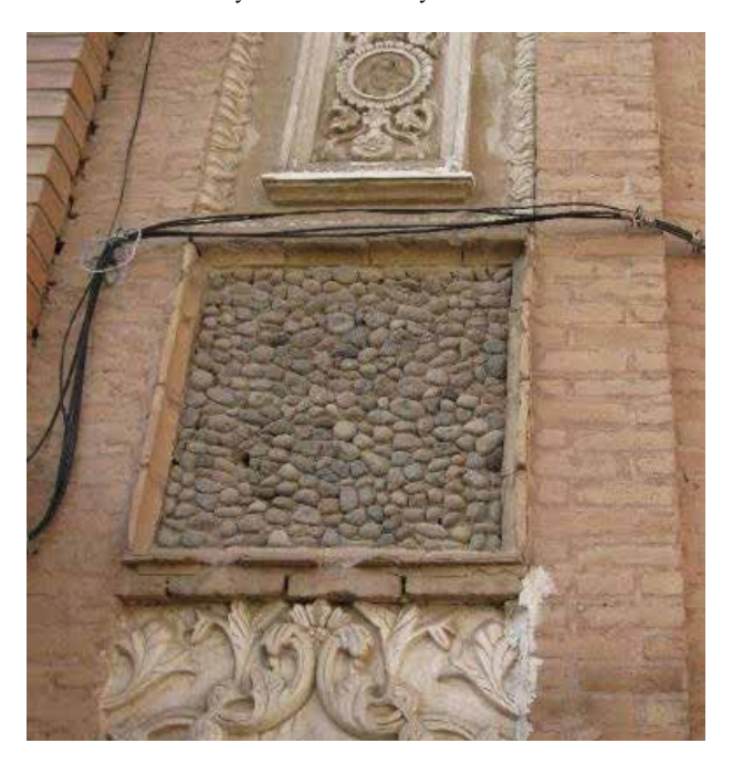
Fig.4. The gravels used on both sides of the façade of Sharbat-Oqli House in Tabriz. Photo: Somayeh Jalali-ye Milani, 2016.

Chand neshini ke khâje key be dar âyad [At the door of the hardhearted masters of the world