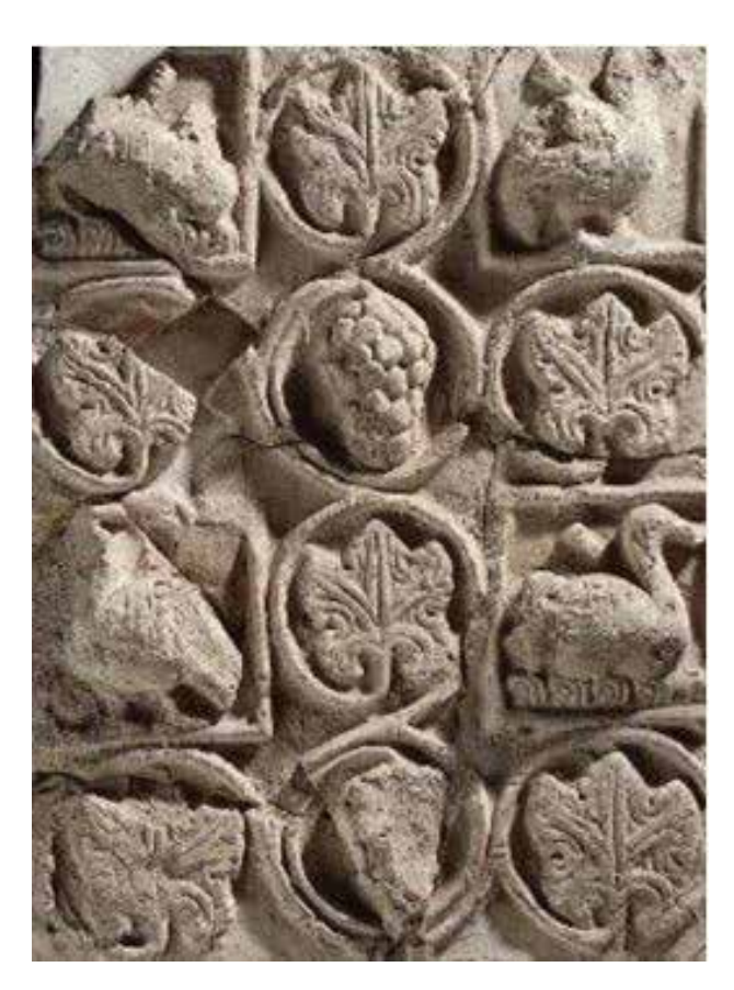
Fig. 10.A molding with the pattern of a bird on grapevine in Chaltarkhan, Source: Mobini &Shafei, 2016,56.

1. Using an iconological approach in studies about the facades of historic houses provides the researcher an opportunity to get knowledge about conscious or unconscious thoughts, existing in architect's, builder's, owner's or every other involved person's mind, that has had an impact on façade design and construction process. It is obvious that these thoughts have been influenced themselves by architectural