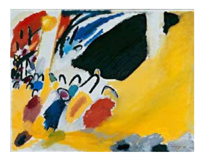
Fig. 6. Impression III (Concert). Source: Kandinsky, 1911 Retrieved from https://www.wassilykandinsky.net/year-1911.php.

Therefore, Islamic artists do not abstain from their subconscious, while the modern Western painters let their uncontrollable subconscious manage the psychological aspects of a work of art. As a result, the artists do not know exactly what is to be created and complete their artwork gradually since it is their subconscious that leads them. This is also true about the other styles of art; however, it is much more common in abstract art. Even in a novel, although