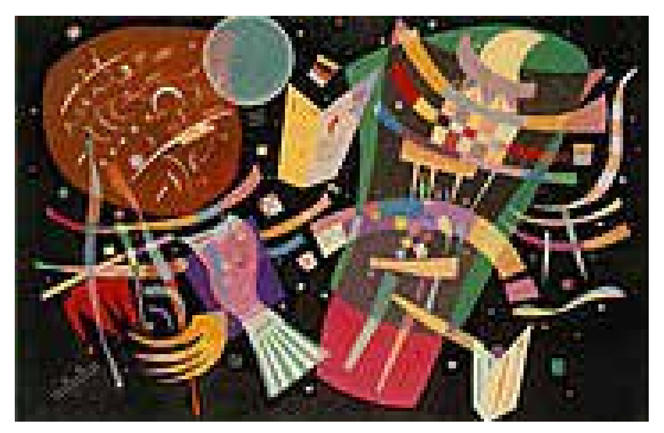
Fig.7. Composition X.

Religious art is associated with wisdom due to its holiness and transcendence. In fact, "religious art is a kind of personal and intuitive wisdom in terms of content and is distinguished from wisdom and mysticism only in terms of expression" (Motahhari Elhami, 2005, 142) That is why, the wisdom of