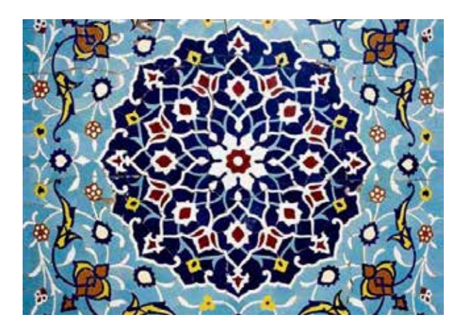
Fig. 1. Shamseh and Arabesque motifs, an example of Islamic abstract art, Imam Mosque. Isfahan, Iran. Source: https://en.imna.ir.

This should not seem surprising or strange since the external manifestation of any religion, civilization, or culture should be a reflection of its inner world. The essence of art is beauty, and beauty should be inside of a beautiful object (the inner aspect or inner coherence) rather than in its objective and physical manifestation or its external appearance. In religious and Islamic terms, this is referred to as having a divine and heavenly quality (Burckhardt, 2013 b, 16). Orientalists (e.g., Burckhardt), emphasize the two-