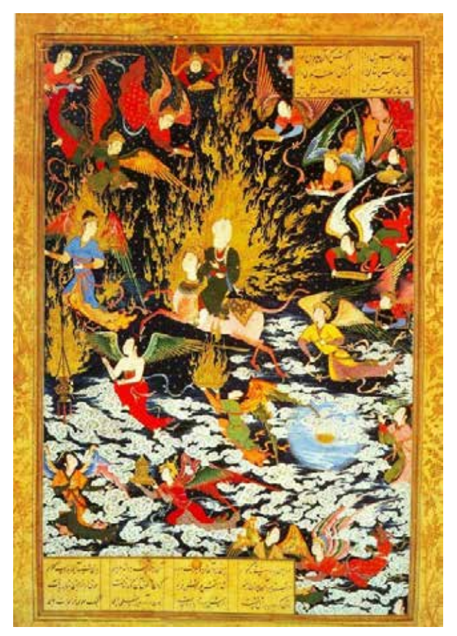
Fig. 2. The ascent of Muhammad to heaven.