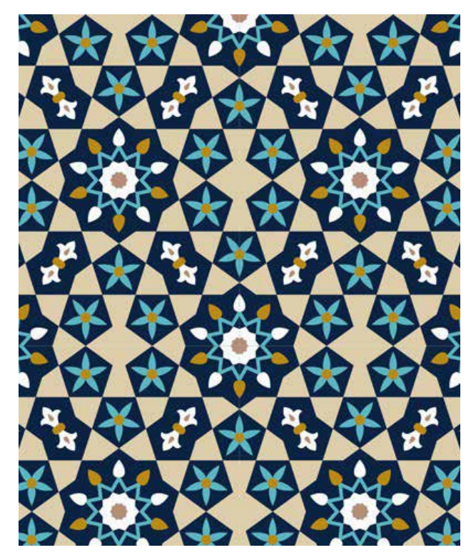
Fig. 3. Islamic geometric patterns, an example of Islamic abstract art.