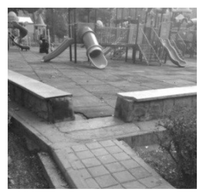
Fig. 4. Inaccessibility of play and sport spaces Fadak Park (district 8).