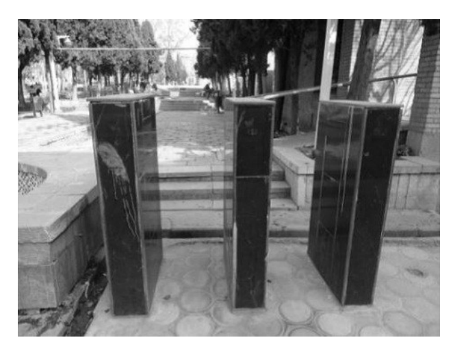
Fig.2. Inaccessibility of Entrances. Daneshjoo Park (District 11).