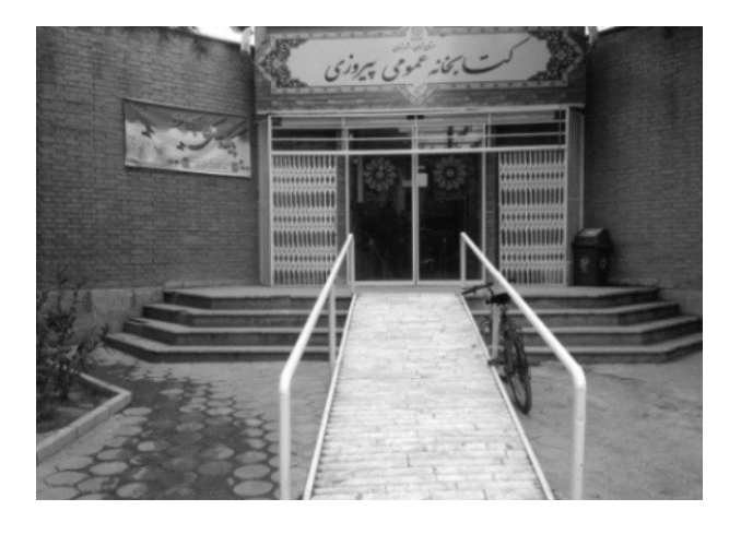
Fig.6. Inaccessibility of Public buildings. Piroozi Park (district 13) Photo: Neda Rafizadeh, 2016.