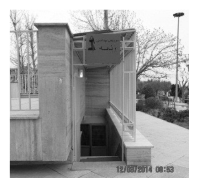
Fig. 5. Inaccessibility of toilets. Almahdi Park (district 9).

It is essential to pay attention to the accessibility