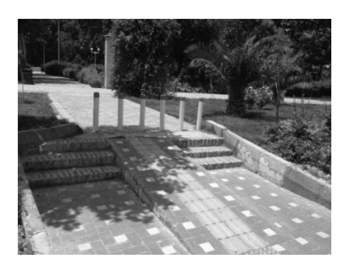
Fig.3. Inaccessibility of sidewalks Baharan Park (District 17).