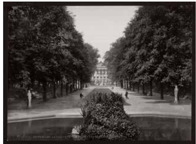
Fig. 3. A photo of Brussels in the 19th century.