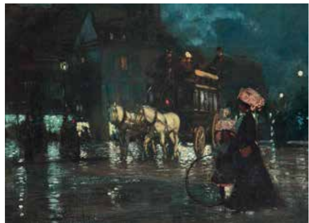
Fig. 11. “A Night in Paris” by Amedee Marcel-Clement, 1873.

It may seem that the above mentioned judgements and the reports are objectively focused on European architecture and town planning. However, they also