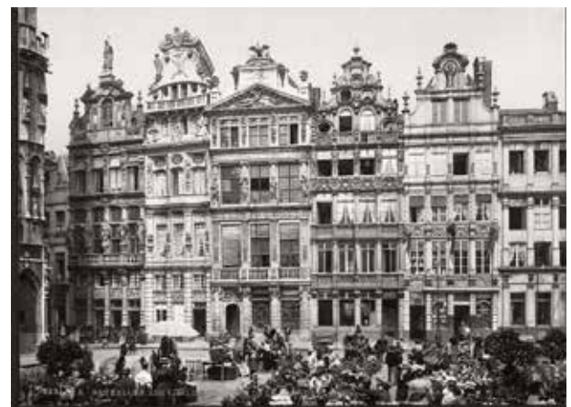
Fig. 7. An image of Brussels in 19th century and its multi-storey buildings.