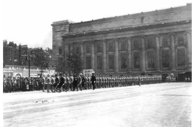
Fig. 10. The opening ceremony of the northern wing of the British Museum in 1914.

Amin al-Dawlah, for instance, writes about the "sections dedicated to the pedestrians" in Champs-Elise (Sarabi, 1994, 214). A little after, he is so astonished by the "Boulevard Avenue" in Paris that he authorizes any exaggeration in describing there. He describes there as a place where "in all nights of the year is a promenade for the people" and "is filled with