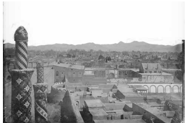
Fig. 6. The skyline of Tehran in late Qajar era in a photo from Antoin Sevruquin. Source: https://asia.si.edu/