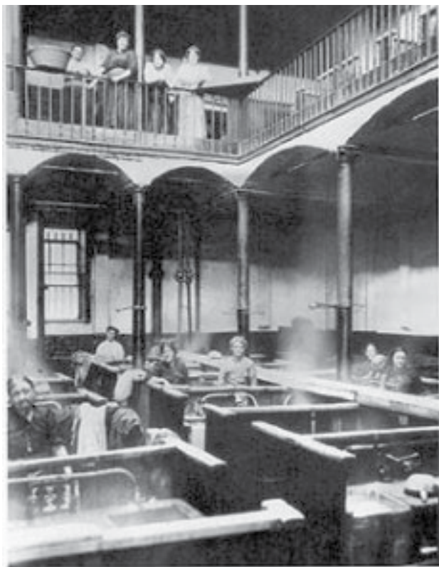
Fig. 1. Public Bath of Fredrik Street in Liverpool, UK.

In Baku, an Asian town in Caucasus, Zahir al-Dawlah writes: “Bravo to this bath. Its cleanliness is indescribable” (Zahir al-Dawlah, 1992, 88). In His words, a modern “numbered” bath is more compatible with Islam: “This is the khazineh water which ulama [Islamic scholars] say is mustahab [religiously suggested] to be drunk in a hand fist, not that khazinehs that I know [in Iran]” and after describing the bath, he prays: “May all my beloved ones come to this clean bath” (ibid). As soon as he enters a carriage, he orders to the carriage driver to take him to “the best of the city’s baths” (ibid, 139). They take him to a bath with “small numbered baths”. He is so excited by visiting the bath keepers in the bath that he satirically compares them to bath keepers in Iran: “Two bath keepers came by. If they were seen in Tehran, they could have been mistaken by an ambassador for sure. I recalled Karbalayi Hassan, the bath keeper in Ja’far Abad. If you pour a fist of millets on his hair, none will pass through his hair [!]” (ibid).