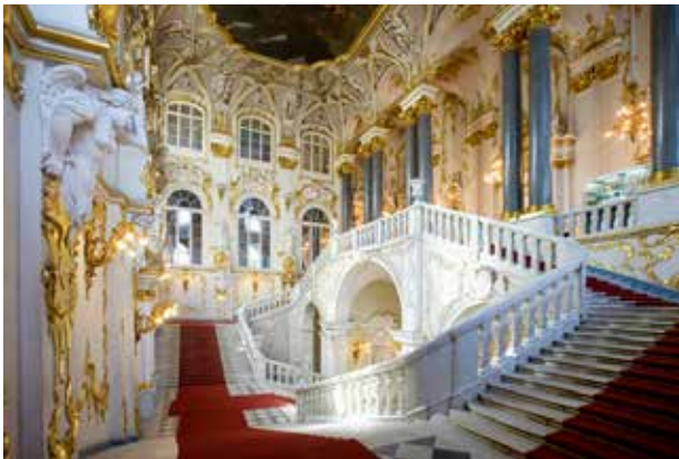
Fig. 8. Hermitage museum's stairs.

Haj Sayyah visits many European museums such as Berlin museum (Sayyah Mahallati, 2011, 495),