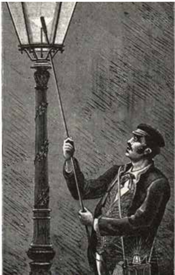
Fig. 5. A drawing about how to turn on a gas lamp in the 19th century (Image courtesy of John Jakle). Source: www.uvm.edu

Stairs and staircases found an aesthetic value for some Iranians during this era. In contradiction to the previous traditions, they became more visible in buildings and thus, their appearance became more important.