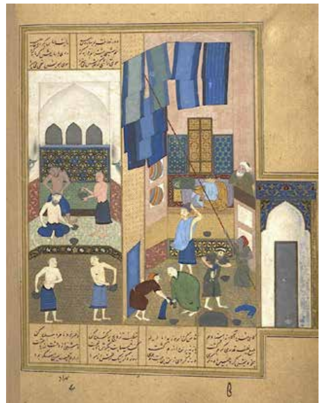
Fig. 2. “Aaron in the Bath”, Attributed to Kamal al-Din Behzad.

Etesam al-Molk, for instance, describes the direct route from the chaharsuq to the southern gate of Tabas in eastern Iran as such: “there is a straight alley