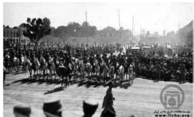
Fig. 12. Toopkhaneh square in Tehran, early 20th century.

In other words, their interpretation of these Farangi spaces is directly correlated to their everyday issues in Iran. On the other hand, other observations and judgements of Iranians which were not obviously related to their concerns on Iranian towns- like