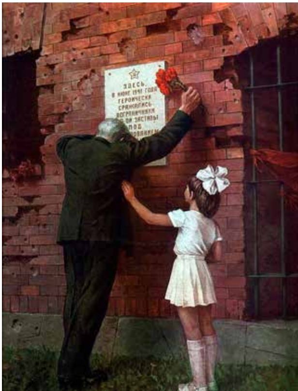
Fig. 9. Don't cry grandfather, V. Licho, 1945.

discourse of the Holy Defence. Fig. 10 demonstrates this spiritual ascension quite properly. Martyrdom, in this discourse, is ultimate individual salvation. There is no loss in being killed but the best of fates.