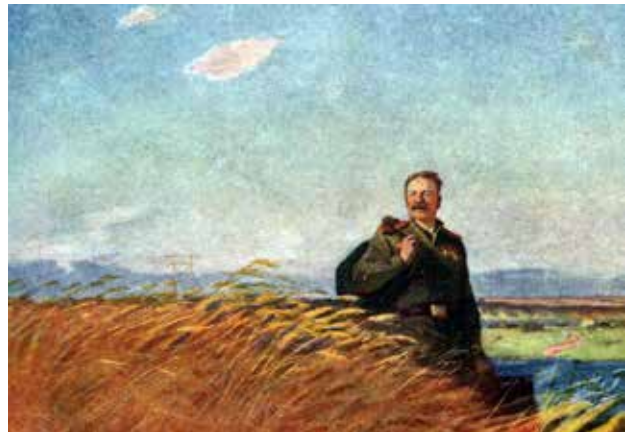
Fig. 7. Return, Andrey Lysenko, n.d.