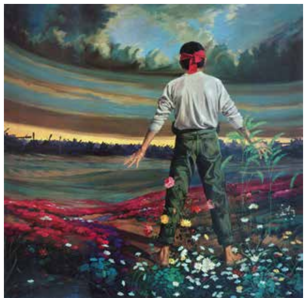
Fig. 3. Resistance, Mostafa Gudarzi, 1986.

the Holy Defence. It is not only the fact that the soldier here is not fighting but furthermore, he is immersed in a hypnotic contemplation in the farthest possible status to the fire and fury of the war.