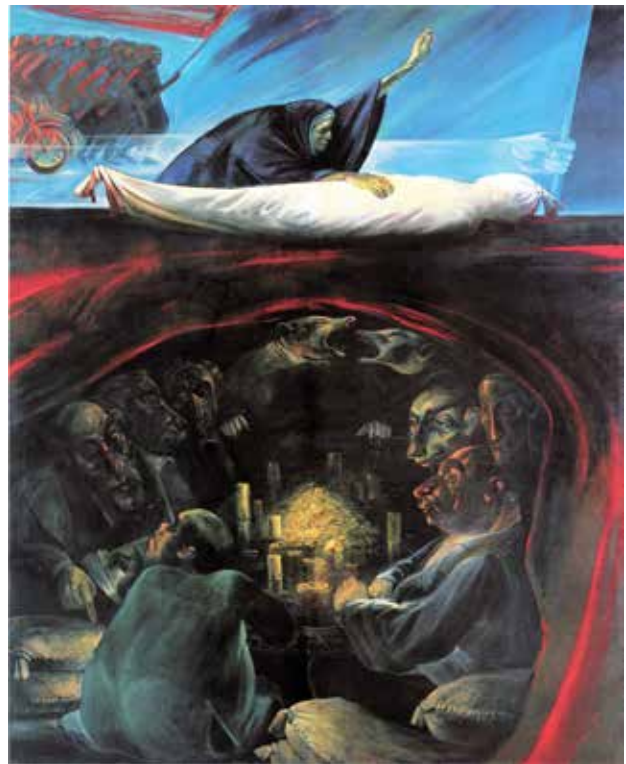
Fig. 2. The Coin Worshipping Rats, Kazem Chalipa, 1984.

The same logic also goes on in the battlefield. Few soldiers the paintings present in the battlefield, shooting at the enemy by their firearms. Bullets will not vanquish the enemy they fight; so, what good are the weapons in the battlefield? The battlefield in the Holy Defence painting is highly symbolic. A renowned painting by Mostafa Gudarzi, 'Resistance,' (Fig. 3) shows us this symbolism in a very evident fashion. A slender adolescent, with a stout spirit though that is emphasised by his posture, has faced a distant shapeless army alone. The ground on which he is standing is all covered with flowers, greenery, and light while the other side is sunk in dark and wilderness. The adolescent boy has no weapons and the fight he is anticipating does not look to be demanding such weapons either. The fight as far as this boy is concerned is more a spiritual notion. This absence of the enemy is the specific trait of the Holy Defence paintings, observable in different paintings that depict the Iranian soldiers. Fig. 4, that is a Russian painting of the Soviet soldiers in the Second World War is right opposite of this standpoint. The apparent enemy that we saw in Fig. 1 requires a fight with machine guns and shelters but the Holy Defence instances seldom show any trace of shooting and physical struggles. Fig. 5 by Ali Vazirian is one of the best paragons of representation of the soldiers within