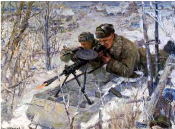
Fig. 4. Machine gun snipers, Fedor Alexandrovich, 1942.

soldiers are rarely seen fighting in the common sense of the word and in many cases, they are not even armed at all. Our soldiers' fight was not against Iraqi foes but a much larger enemy that has been mentioned before. To fight such worldly material vice, one demands certain spirituality, an inner growth, which has become possible by religion and mysticism. Fig. 2, 3 and 5, are examples of the inner struggle of these fighters. The enemy by its very nature defines the way of the fight. The soldiers in this image are depicted precisely opposite the enemies (Fig. 2). The modesty of their looks and the humane serenity in their countenances