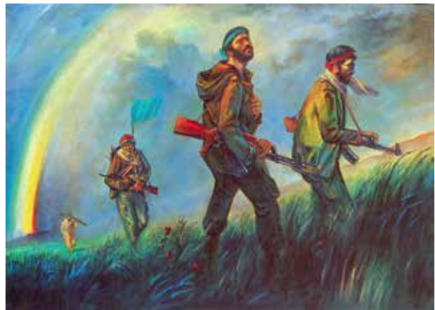
Fig. 8. Vanguards, Kazem Chalipa, 1982. Source: Chalipa, 2012.

highest victory. So what is usually identified as a loss in a normal war is regarded as the highest achievement in the Holy Defence painting. In such discourse, no achievement in the world beats being killed or amputated in the battlefield and such losses are honours that not everybody is worth them. So, the dichotomy of the victory and the defeat takes the shape of the dichotomy of the victory and the martyrdom in this discourse that is derived from the profoundly spiritual