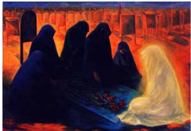
Fig. 12. Behesht-e Zahra, Abdolhamid GHadirian, 1982.

What is revealed by the examinations brings the articulation of different signifiers within this discourse to light. Needless to say, the definition of the enemy and the fight in this discourse necessarily demands a certain way of looking on the notion of victory in such fight and across such enemy. In a discourse that defeat bears no meanings and death is regarded an achievement rather than loss, the relation between the frontline and home inevitably changes. While most discourses about war see the return to home as the return to the good, here the spiritual superiority of frontline prevents the homecoming from being so dignified and revered. It does not matter the war has halted or not, the frontline is always better than home. The family who bears this inconsolable