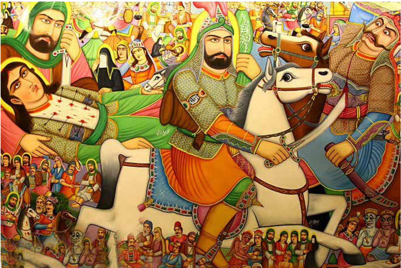
Fig. 2: part of artwork (number 1) of Moslem Ibn Aqil ..., pictorial source: Imam Ali museum.