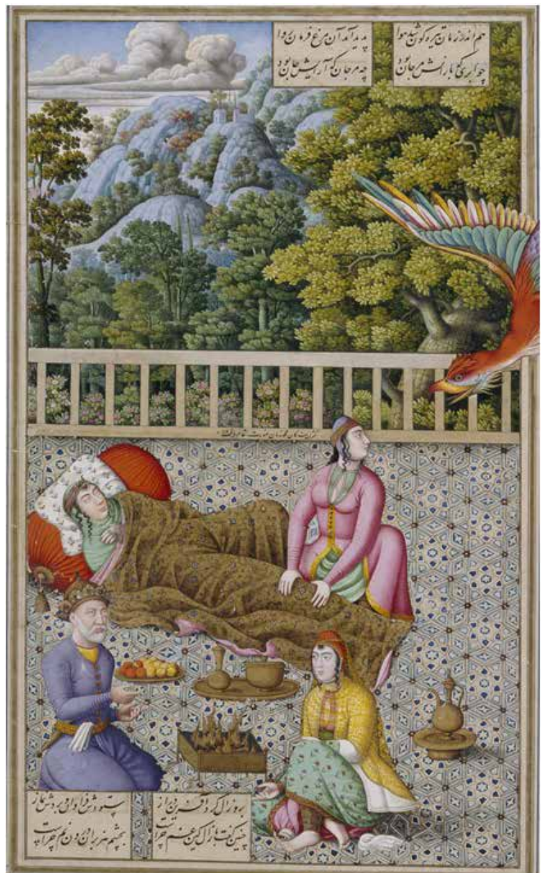
Fig. 2. A part of “Bahram Goore and misery” Persian miniature, by Mohammad Zaman, 1087 A.H.