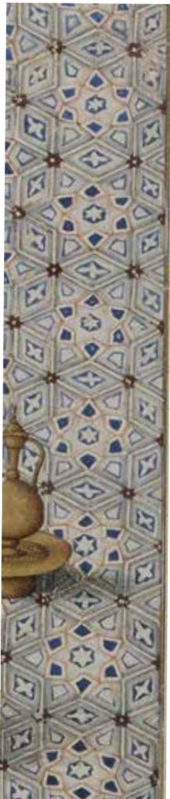
Fig. 3. Zooming a part of Fig. 2.

Fig. 2 and Fig. 3 show another painting of Mohammad Zaman. The transformation in the