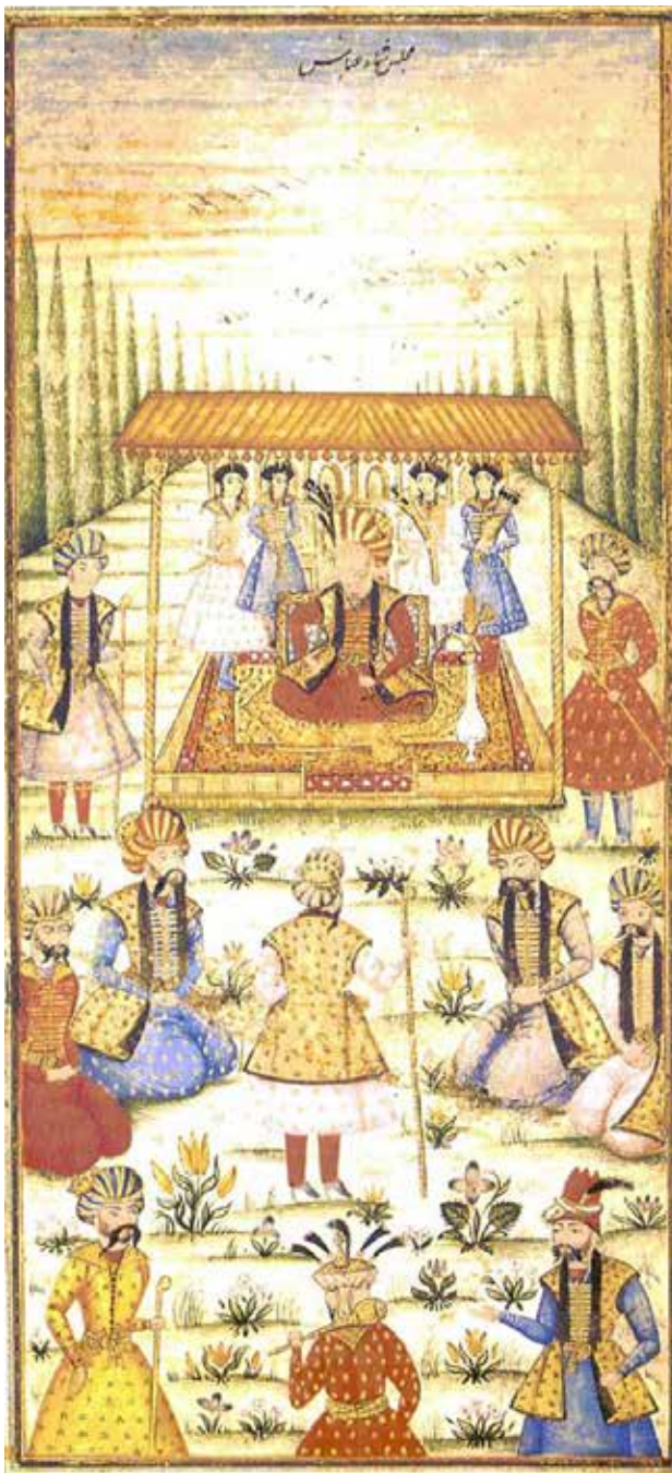
Fig. 7. "Shah Abbas awaits the people in the parliament". The second half of the 12th century A.H.

observed from the above. A precise look to the carpet shows that the size of the flower and the beads of this carpet is equal in its two longitudinal points (the axis upon which the depth is created). Therefore, it can be said that shortening is not created precisely in depth (the front part) of the painting. In addition to