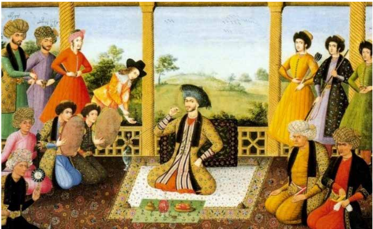
Fig. 6. "The king and the courtiers." by Aligholibeyk Jabadar. The second half of the 11th century A.H.

horizon”. Moreover, the floors, tents, canopies, or basins are shown from an angle that represents their shape and details according to an ideal and complete plan. Fig. 4 and 5 illustrate these Persian painting traditions. In Fig.4, the design of floor mosaics from the vertical angle creates a strange atmosphere. Similarly, Fig. 5 illustrates an example of the “high horizon” depicted in the Persian painting tradition. Such a spatial composition is apparent in most of Aligholibeyk Jabadar’s paintings- a renowned Farangisaz of the time. Fig.6 is among the official and significant works of Aligholibeyk Jabadar. The spatial construction of this work is similar to that of Mohammed Zaman’s (Fig. 1 & 2). Behind the statue, a landscape is depicted on the basis of aerial perspective. The colors disappear to the horizon and the details in the design of the objects are eliminated gradually. The trees also become smaller in size as they proceed to the horizon in accordance with the rules of perspective while the point of view is changed and became vertical in the previous section. It seems that the carpet under the king’s and the courtiers’ feet is