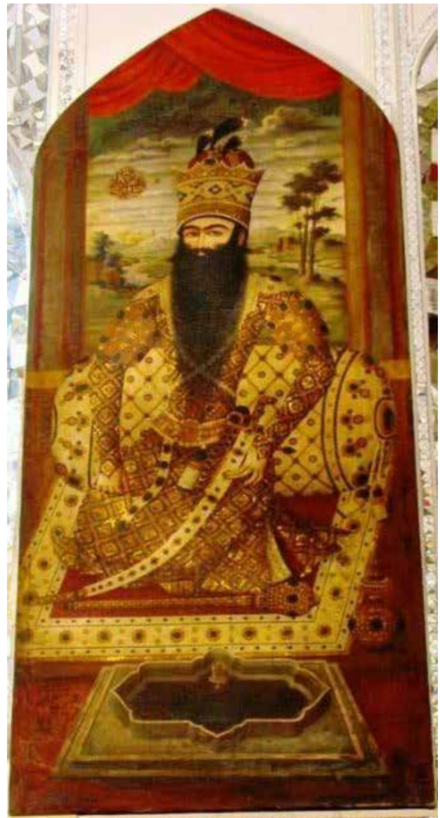
Fig. 8. Portrait of "Fath Ali Shah". Golestan palace.

observed from the above. A precise look to the carpet shows that the size of the flower and the beads of this carpet is equal in its two longitudinal points (the axis upon which the depth is created). Therefore, it can be said that shortening is not created precisely in depth (the front part) of the painting. In addition to