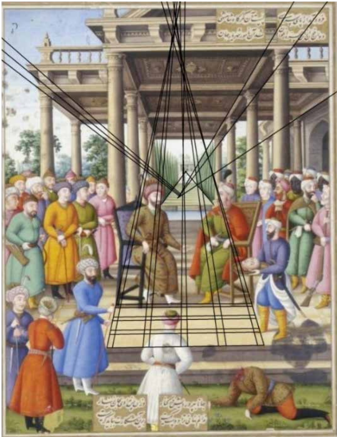
Fig.1. Perspective analysis in “Presenting Iraj’s head to his brothers Salm and Tour” by Mohammad Zaman, 1086 AH.

In the last quarter of the 11th century, this influence was magnified in the paintings of Europeanized artists