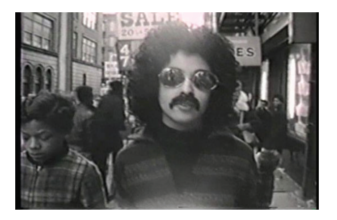
Fig. 3: Adrian Piper (1973) Mythic Being.