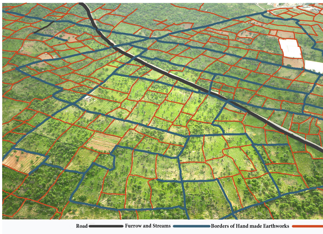
Fig. 4. Land pattern from bird view as organic, non-geometrical network of short earthworks which separate the border of the Gardens.