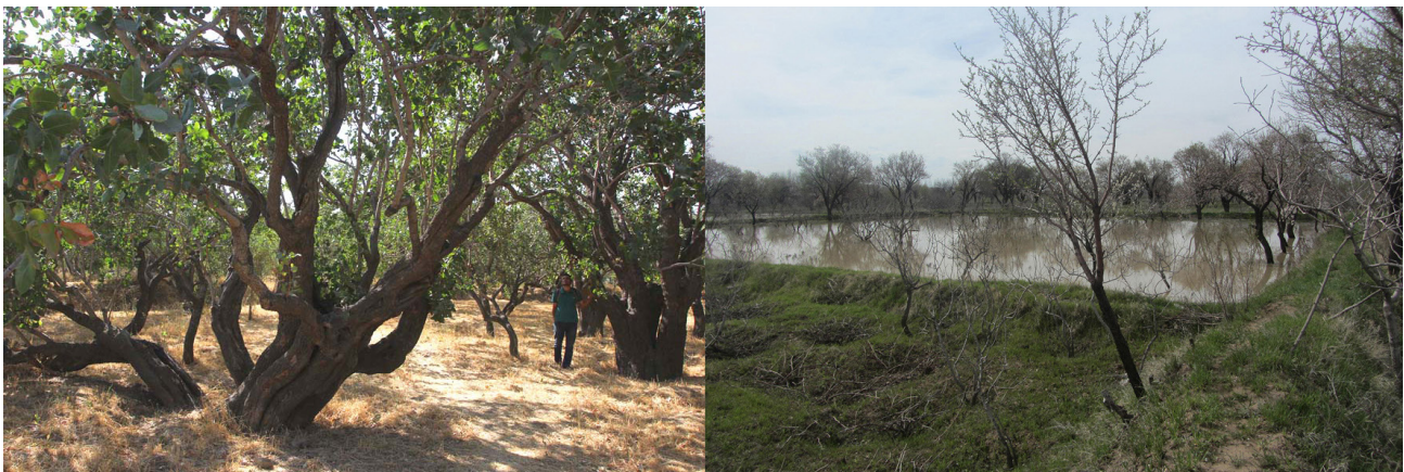
Fig 1. Right: the mixed cultivation of the gardens and the flooding irrigation. Source: the authors. Left: the old pistachio trees in the fruit season. Source: Personal archive of Mahdi Motamed.

Generally Cultural Landscapes are divided into 3 main categories: landscape designed and created intentionally by man; associative cultural landscapes which shows virtue of the powerful religious, artistic or cultural associations of the natural element rather than material cultural evidence; and the organically evolved landscape which results from an initial social, economic, administrative, and/or religious imperative and has developed its present form by association with and in response to its natural environment. The Qazvin's Gardens can be considered as a subcategory of the organically evolved landscape called "continuing landscape" which retains an active social role in contemporary society closely associated with the traditional way of life, and in which the evolutionary process is still in progress. At the same time, it exhibits significant material evidence of its evolution over time (WHC, 2008: 84).