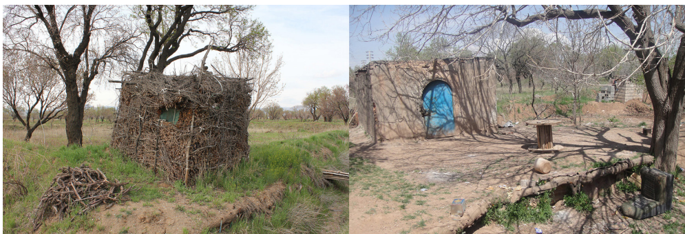
Fig. 2. Right: well-house (chāhkhāne) made from brick and some shading trees such as a berry tree for the rest of the gardeners. Left: bower-house (āle) made from branches for the monitoring of the gardens.