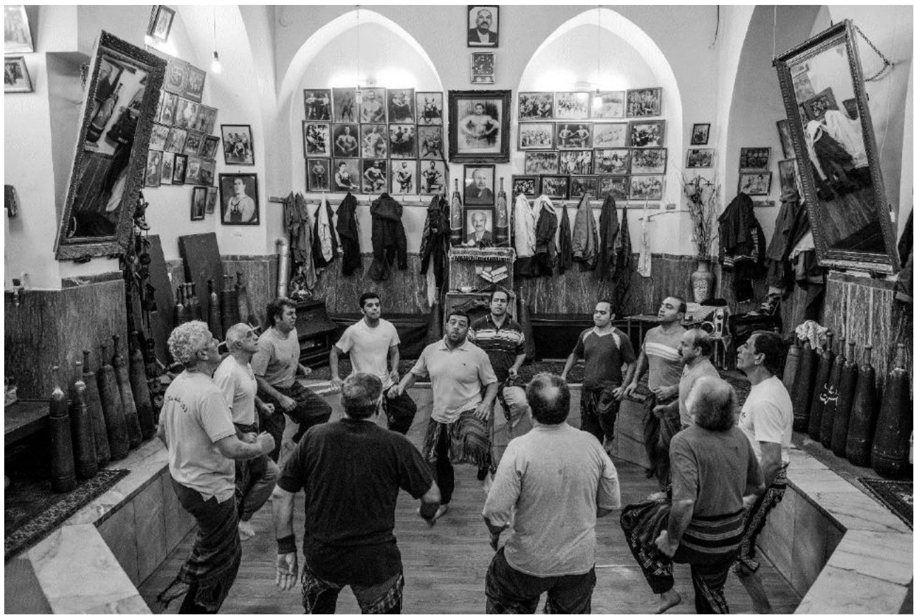
Fig. 1. Excessive use of frames and symbols and revered and sacred figures is indicative of another aspect of this sport which deals with mental and moral training of athletes.

these two fields. With regard to the substance and nature of these two concepts, we can roughly achieve a common language in the context of architecture and zurkhaneh music. Based on findings, quantitative characteristics of physical nature include: