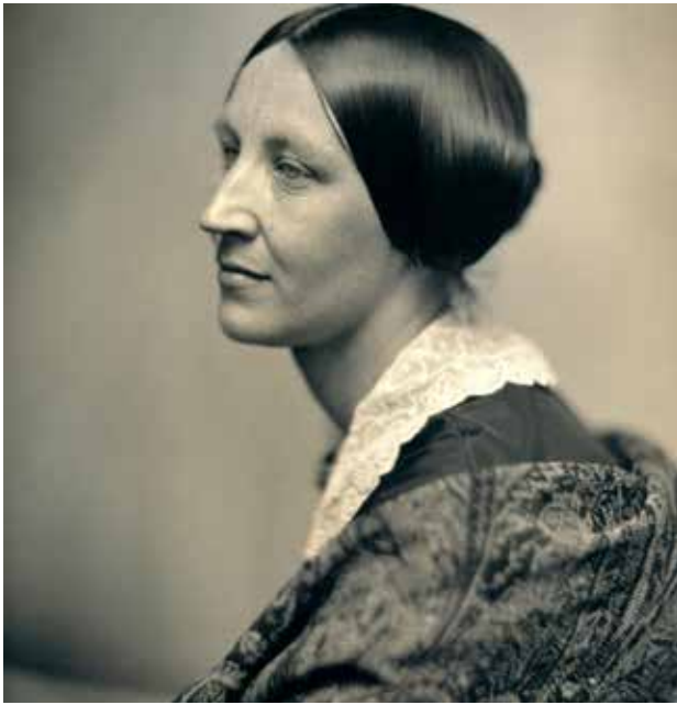
Fig. 3. Susan Brownell Anthony, American social reformer (1820-1906): Albert Southworth & Josiah Johnson Hawes, between 1850 and 1871, a daguerreotype between 1850 and 1871. In all primitive daguerreotypes and most of the later photos, the solemn gesture without smile in front of the cameras, was based on one's intellectual background of painting's iconographies. The mysterious quality of camera and the way it worked and its stunning clarity, made these images as painting icons to their owners.