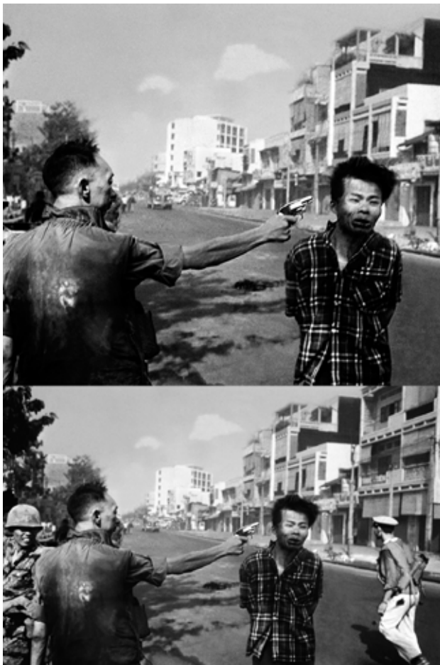
Fig. 6: Saigon Execution, Murder of a Vietcong by Saigon Police chief; Eddie Adams, 1968. While the represented reality is exposing in the photograph, in any way it must approve the absence element: The photograph always substitutes and emphasises its represented reality; In such a way that: a- As the straight photographer take the exact reality with no caption or statement accompanying it, the represented reality, is a part of reality that a photographer has elected behind the camera, and stresses on the absence of what is eliminated from the frame; b- Or the represented reality requires a statement to explain a reality which is occurred but not framed; c- Or the photographer might change the represented reality by editing the photograph after shooting; d- Or a represented reality might be created in front of the camera( e.g. staged photographs); e- Or the presented reality is essentially made of nothing (e.g. the augmented reality in digital manipulated photos; ).

In the original photograph of Saigon Execution (bottom), just a cutting part containing Police chief and executed man was published and distributed in media. Later Eddie Adams had regretted for blemishing Generals prestige because of publishing the photograph before explaining the fact that the executed man had cooperated in five Vietnamese murder.