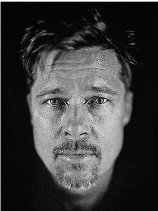
Fig 9. Brad Pitt; a daguerreotype by Chuck Close, 2009

icons, photographic icons always emphasize the absence –metaphysics, intuition, Transcendent element. In this attitude, photographic icons find an apotropaic function, so that they relieve their special viewer from the forgetfulness and distance them from the fear of that. This functional aspect of photographic icons is observable especially in the private and family photos of people in their personal spaces, such as their wallet and their working or living place (The reason people keep the photos of loved beings in wallets is that, every time they look at them and remember them, photos create a behavioral safety in them and encourage them to do a better action. As well as photos of the deceased members are kept in the workplace of the family for gratitude and keeping their memories alive). On the other side, the photography medium rejects any metaphysical relation and emphasized merely the reality of the photographed image. The metaphysical understanding of the photographic icons by the viewer and the insistence of the