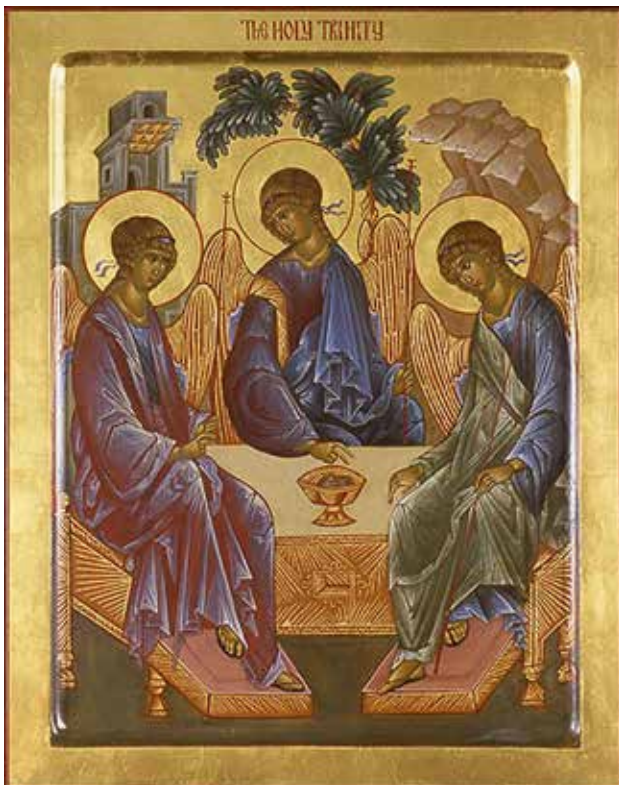
Fig. 4. Holy Trinity, the original work by Andre Robulf.

photography, something else happens too. By contrast, something takes place in front of the photograph. As we look at the photograph in the albums, on the walls and in the niches of private spaces, on one hand, we encounter with more details than what a painting offers, and also with its hints, that the reality is what the photo shows; On the other hand, because of the nature of the private space, it takes more, pause and contemplation in photos viewing, which leads us to the perception of the meanings similar to our tendency or understanding in front of the holy icons in sacred places. Just as icons hide the divine being, photographs -especially the private and family photos when they are seen with pondering in private spaces- put a mask on the understanding of their visual cues.