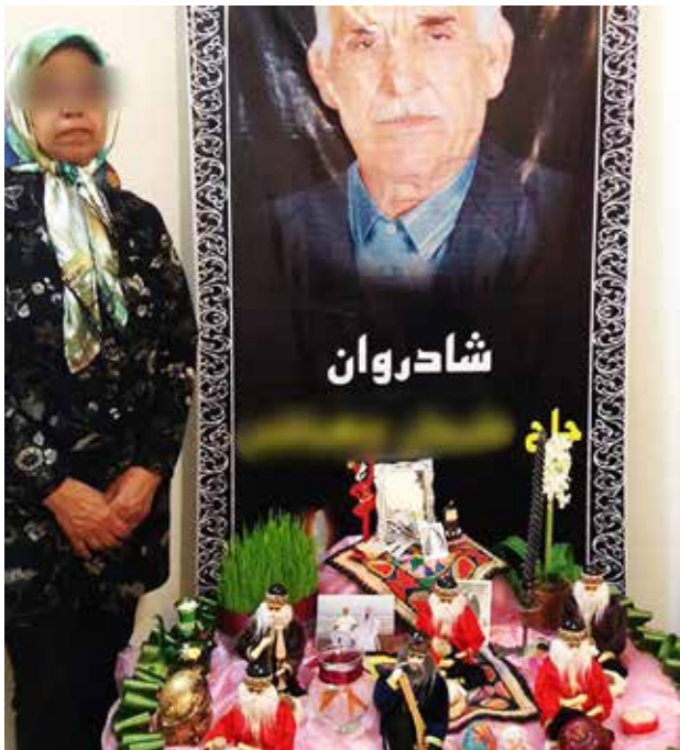
Fig. 12. The woman next to her dead husband at the beginning of the New Year, private collection, 2017. The memorial photographs named "temsaaal"(Persian language in Iran) in verbal tradition are extensively presented in religious and funeral ceremonies and celebrations in traditional style.

that many people carry with them always obviously belong to the order of fetishes in the ordinary sense of the word" (Metz, as cited in Wells, 2013: 232).