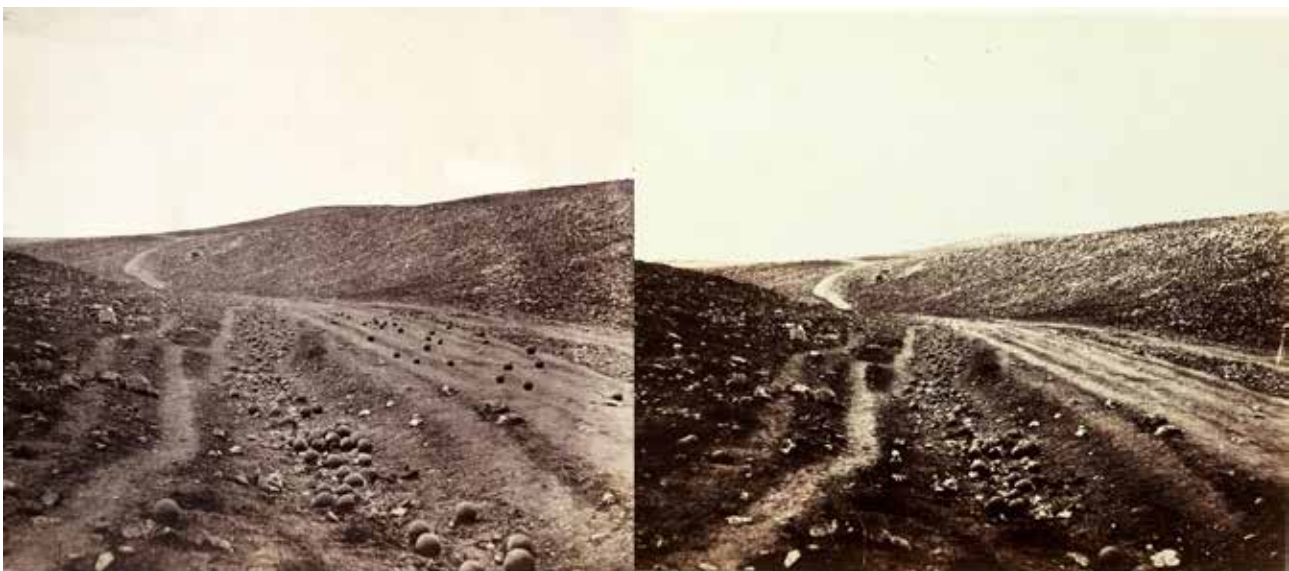
Figs. 1&2. Valley of the Shadow of the Death; Roger Fenton, 1855. “Valley of the Shadow of the Death” was a region under constant shelling. These photographs are related to this place only in the title. The right photograph (not published) was taken first and after that, to simulate the scene similar to the valley of the shadow of death, Fenton’s assistant placed the cannonballs on the road, then the second famous photo was taken, the one broadly published.

always been an obsession in the human’s mind until the time photography could prove it on sensitive surfaces and caused a dramatic change in the aesthetics of image perception which was very mysterious and vague. The essence of two raw materials of photography, light and time, makes it so amazing and strange,. “Every photograph presents us with two messages: a message concerning the event photographed and another concerning a shock of discontinuity. Between the moment recorded and the present moment of looking at the photograph, there is an abyss” (Berger & Mohr, 2004: 86). The insistent photography confirms all of these through its apparently direct relationship with the reality of what the camera records, but in many cases, that declines and denies all clearly in front of the viewer. “Something we hear about but doubt seems proven when we’re shown a photograph of it” (Sontag, 2013: 10). Therefore, this testimony turns to be complicated in meaning when the viewer becomes aware of the direct intervention of the photographer in “constructing the reality”. Like the new awareness achieved recently from