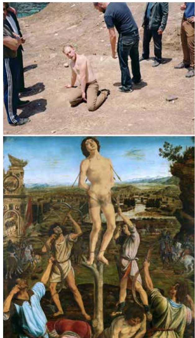
Fig. 8. (top): Listener; Jeff Wall, 2015. The violence in the image is both quietly real and artificial. Wall tried several months to indicate how media and artists (newspapers, television, internet...) represent the violent moments and intercalated the common features of these anomalies in his image composition. This iconography is very similar to Christ crucified image; the painful body among the filthy people in an uncertain place. of course in a modern and photographic way!

The self-conscious awareness of being in a camera-based and camera-bound culture is an essential feature of the conceptual aspects of contemporary photography (Grundberg, 2003: 170); Which that causes, the camera’s presence likes eyes that are constantly observing people’s lives, relationships, and moods, and subsequently, It provides accurate judgment in the discovery of truth, and brings justice to social life. Some critics have been terrified by the replacement of the camera lens with God’s eye and declare that the capitalist culture has summed up God in photography! (Berger, 2001: 78). Prepending about this function of photography has been caused to shifting in the way of looking at some issues such as the power of memory, judgment and human justice. Such self-conscious awareness in the scope of photography has incited some