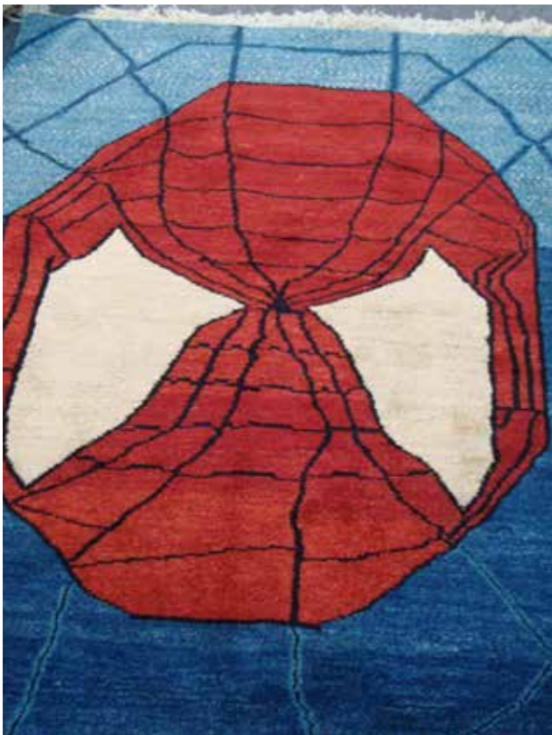
Fig. 1. Spiderman Mask Design Knotted in - Tabriz Rug.

statistical population include: collage in the form of a combination of a rug with leather or pieces of other rugs under the influence of collage style in the west, the unusual dimensions and shapes of rugs, widespread multi-level surface rug knitting, volume knitting in the form of jars, portraits, and spheres, and very high and unnecessary raj-counters (Fig. 3).