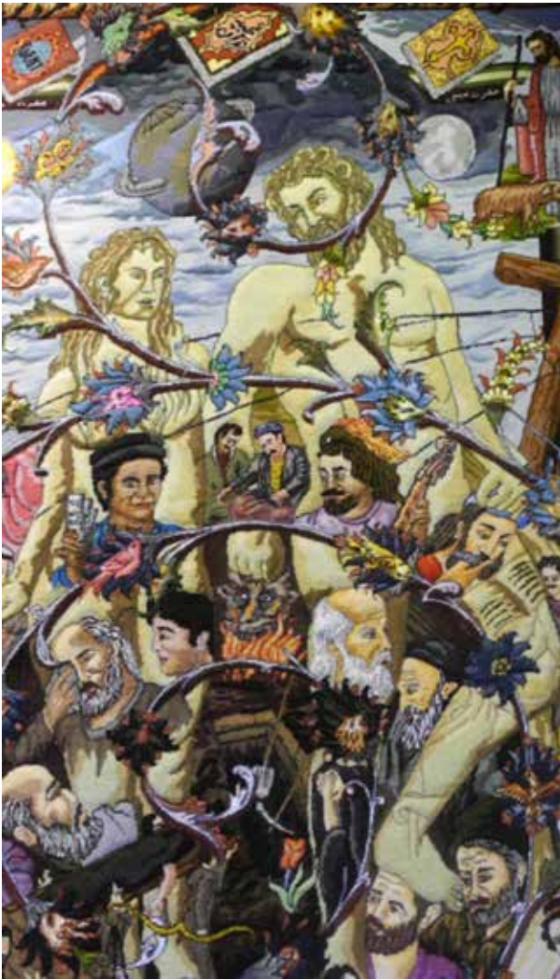
Fig. 3. A Part of the Rug Called the Circulation of Creation. Source: Author, 2018.

of the market and the customer are important and we should do in line with the customer's opinion." Such an attitude is a prevailing and growing approach in Tabriz rug design and production system. Hence, according to Spooner (2011), "today, weavers or designers do not pursue the practice of the ancestors regarding the use and repetition of the traditional motifs to be the more similar to the past works and to gain the admiration of others in the same guild; instead, they are trying out practices that please those who make purchases for foreign markets. This change of attitude has made apparent changes in the general qualities of the rug, such as the combination of motifs and the choice of colors" (Spooner, 2011: