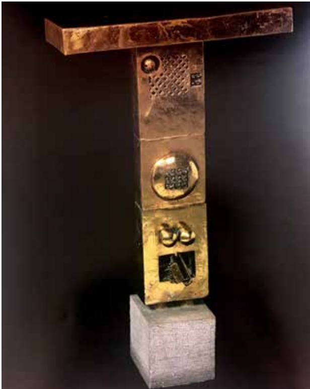
Fig 1. Parviz Tanavoli. Poet, Cage and Nightingale. 1970. Height: 92 cm.

from the pure structure of letters and words. For these artists, the readability and meaning of the