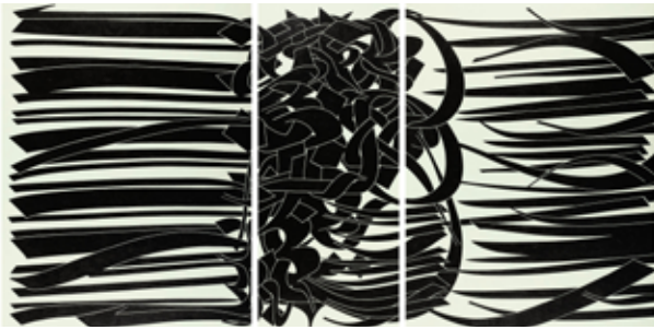
Fig 3. Mohammad Ehsai. Banquet. 2009. Oil on canvas. 260 x 564cm