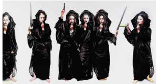
Fig 18. Afshin Pirhashemi. Seduction. 2010. oil on canvas. 200 x 298cm.

With photography at home or studio, Shadi Ghadirian