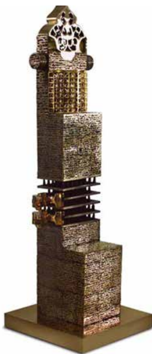
Fig 2. Parviz Tanavoli. Poet and Cage, 2008. Bronze. Dimensions: 151 x 50 x 50 cm.

writings, or their direct connection to religious and literary texts was not very significant. Ehsai and Afjei continued creating written compositions in a different, yet still formal, shape (Fig. 3 to 6). Shishegaran, the modernist artist of the decade before and after the Islamic Revolution of Iran, experimented with different painting and graphic arts, which sometimes required a socio-political and sometimes an abstract approach, and eventually established a special abstract style inspired by Persian calligraphy, graffiti and pop painting. “Hamid Dabashi 6 who follows Shishegaran’s progress from modernism to his current theories and practices of abstract line drawings (khat-khati in Persian) inspired by Persian tradition of the calligraphic arts, says: I think of it as a form of linear abstract expressionism (Nakjavani, 2017); (Fig. 7 & 8).