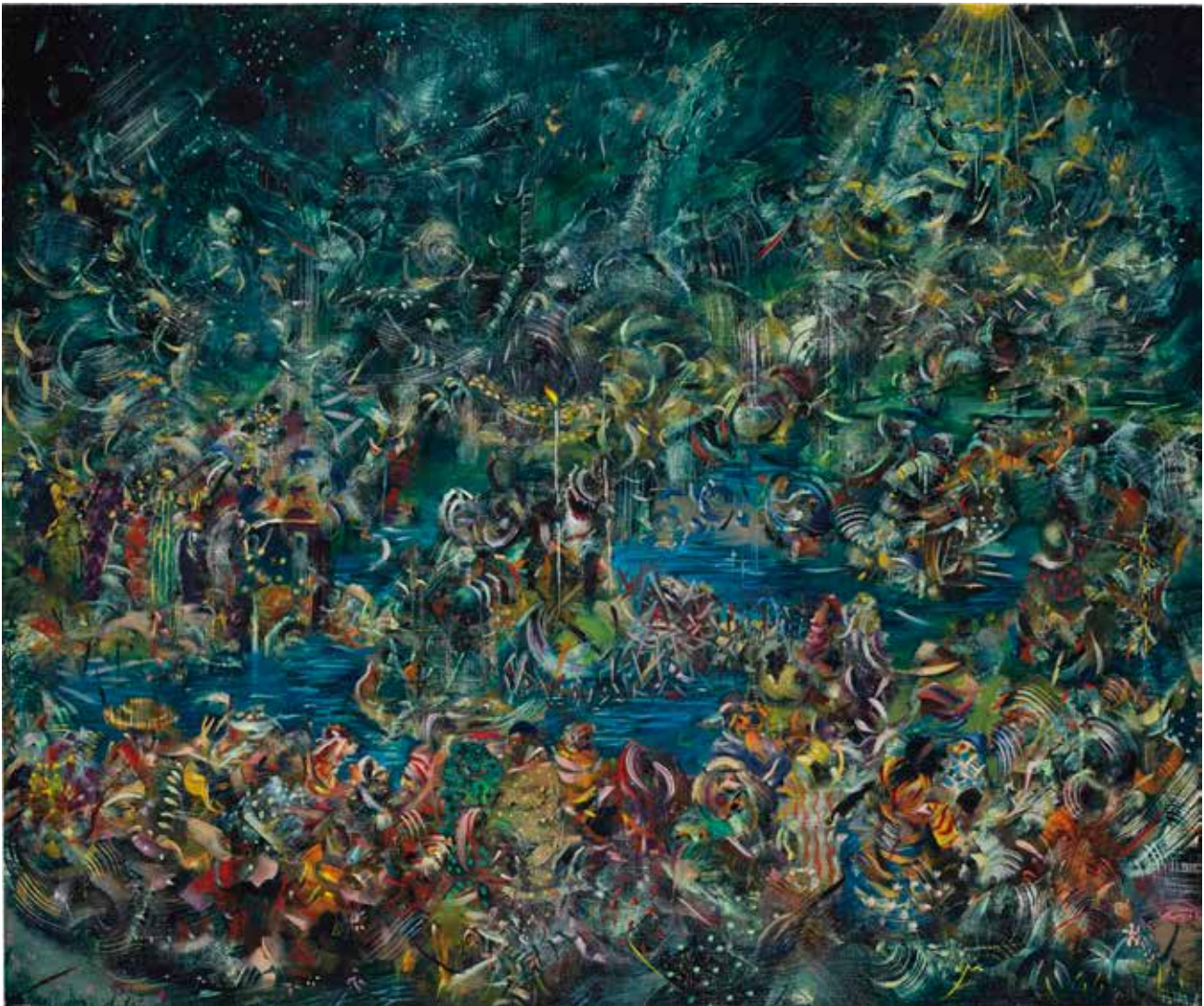
Fig 11. Ali Banisadr. The Light. 2010. oil on canvas. https://www.christies.com

market trends and works that are concerned with the vernacular culture. Pop art is based on images of mass consumer culture [...] Comic books, advertisements, packaging, and images from television and the cinema were all part of the iconography of the movement (Chilvers & Graves-Smith, 2009: 1552). The visual pop culture was characterized by flamboyance, vulgarity, banality, or generally its so-called “kitsch” quality, being contrasted to the high elite culture. As the most representative form of postmodernist artistic expression (in its approach to popular culture and kitsch taste), pop art intended to ridicule the seriousness of high art; however, due to the weakness of its critical expression, eventually, it surrendered