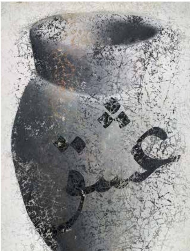
Fig 13. Farhad Moshiri. Love. 2003. Oil and acrylic on canvas. 271 x 181cm.

painting or installation, and sometimes employs techniques that are unusual for high art, such as traditional Iranian embroidery (Fig. 12 & 13).