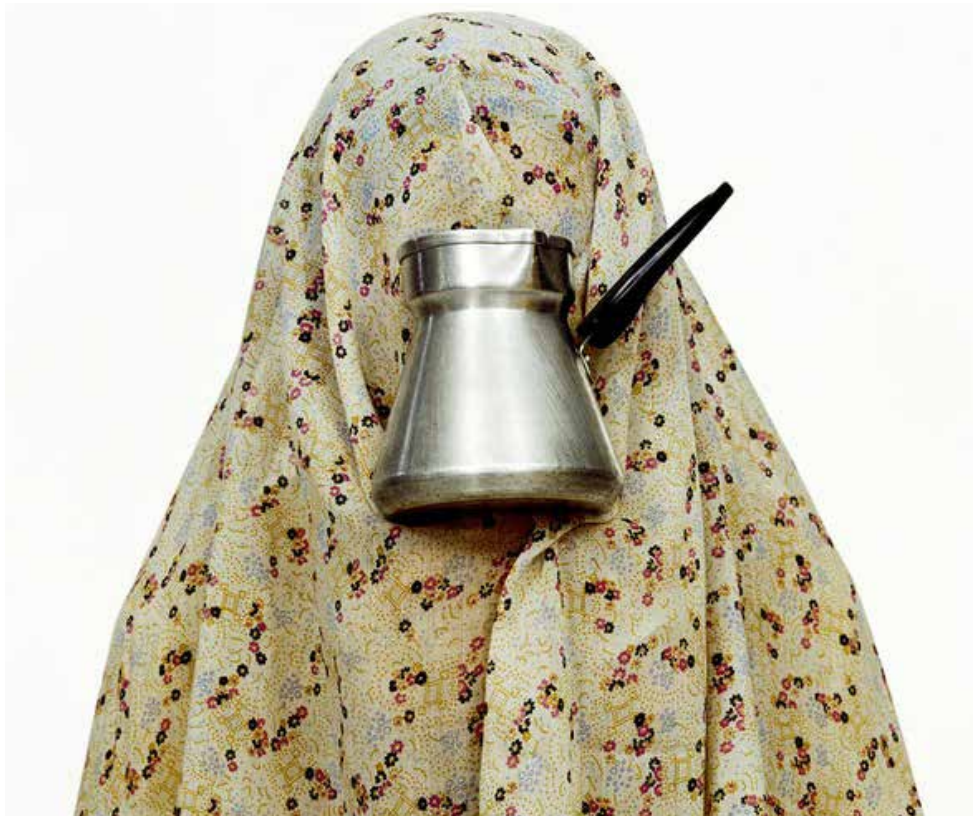
Fig 19. Shadi Ghadirian. Like EveryDay#1 . 2000. C-Print. 50 x 50 cm.

dominant model for many young Iranian artists. But according to Jameson, under postmodernism parody ceases to be a potent cultural force; it ‘finds itself without a vocation’ whilst ‘that strange new thing pastiche slowly comes to take its place. Pastiche is a parody emptied out of content. It is a neutral practice of mimicry, without any of parody’s ulterior motives. (Roberts, 2007; Jameson, 1998).