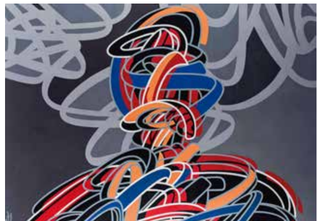
Fig 8. Koorosh Shishegaran. Figure. 2014. acrylic on canvas. 160 x 200cm.