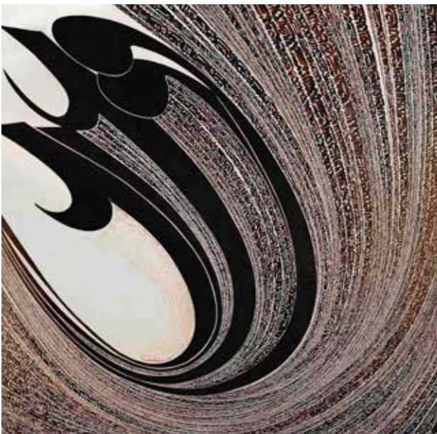
Fig 5. Nasrollah Afjehei. Love. 2010. acrylic on canvas. 200 x 200cm

Newer formalist trends are incapable of creating a real transformation in the nature of plural components that shape the structure of the images, even using a postmodernist approach. Representatives of this