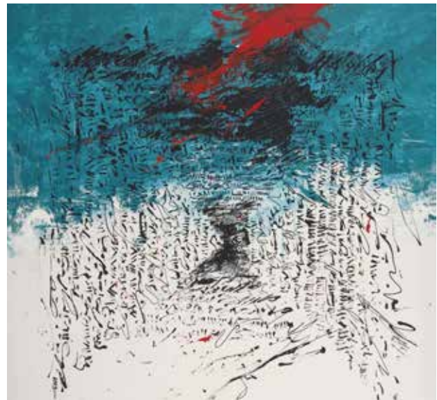
Fig 9. Golnaz Fathi. Untitled. acrylic on canvas. 160 x 200cm.

How can you not take advantage of the new image, which is transformed only in appearance, for hegemonic purposes? How will the new image truly