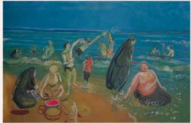
Fig 20. Rokni Haerizadeh. Shomal (Beach at the Caspian). 2008. oil on canvas in two parts. 200 x 300cm.