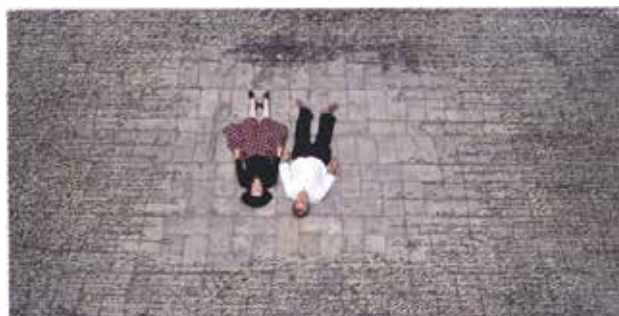
Fig 17. Shirin Neshat. Munis and Revolutionary Man (from the Women Without Men series). 2008. C-print and ink. 138.4 x 243.8cm

other young artists, fundamentally lacks the ability to address controversial social subjects in contemporary life. Moreover, when approaching the female subject, he does not rely on a creative and personal approach, and his image of the mysterious or seductive woman in the modern-semi-traditional Middle Eastern societies looks like updated oriental stereotypes (Fig. 18). The artist's innovation is limited to displacement of scenes and backgrounds, introduction of the signs of modern life in contrast to tradition, and reliance on the symbolic meaning of objects. Changes at this level may be intriguing in visual and aesthetic terms, however, hoping for a more extensive social outcome, such as confronting or challenging a viewer's perspective, who encounters the people from the East with a mind