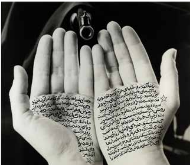
Fig 16. Shirin Neshat. Guardians of Revolution 1994. (from the 'Women of Allah' series). ink on gelatin silver print. 110 x 99.7cm.