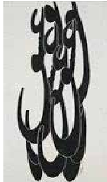
Fig 6. Nasrollah Afjehei. Love, 1984. Oil on canvas, 150 x 50 cm.

Newer formalist trends are incapable of creating a real transformation in the nature of plural components that shape the structure of the images, even using a postmodernist approach. Representatives of this