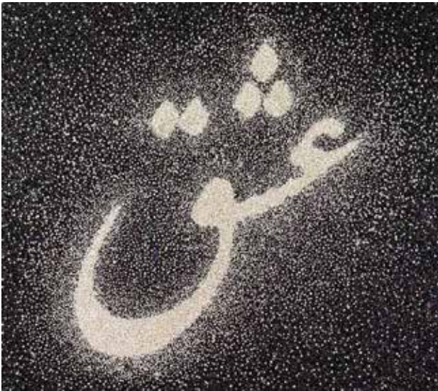
Fig 12. Farhad Moshiri. Love. 2007. Swarovski crystals and glitter on canvas with acrylic, mounted on mdf. 76.5 x 91.5cm .