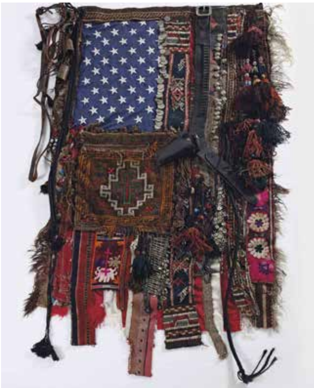
Fig 22. Sara Rahbar. Flag #15. 2008. installation from textile, leather belt, carpet, tassels, coins and metalstars. 203 x 100cm.

words, the reception or loss of which qualities make cultural identity suitable for a lucrative and safe commodity exchange in the area of art? Through analysis of the prevailing orientations in the contemporary Iranian art market toward cultural identity, this study concluded that cultural identity has been vulnerable to commodification more than anything else due to its separation from historical meaning, and, subsequently, failure to gain significance and a positive function in the contemporary time. By emptying cultural signs from their previous content and introducing them into the aesthetic play of form, color, and texture, Formalist movements turn cultural identity into nothing more than a layer for embellishment of the artistic commodity. Artists subscribing to a more progressive approach intended to deconstruct the East-West identity, but their mere formal combination of the visual languages of the two cultures yielded nothing, except production of a more appealing product for the