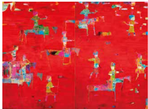
Fig 10. Reza Derakhshani. Bloody Hunt. 2016, oil on canvas. 183 x 244 cm.

change the unequal status of the marginality and center? When a remarkable and beautiful object that is created through mixing of (formerly contradictory) Eastern and Western identities has a permanent customer base as the contemporary regional art, without effectively challenging the prejudices, it is destined to become a commodity that serves capitalism. Formalism can disarm and neutralize any kind of cultural resistance, and ultimately, tailor artistic production to suit the business and trade processes through commodification.