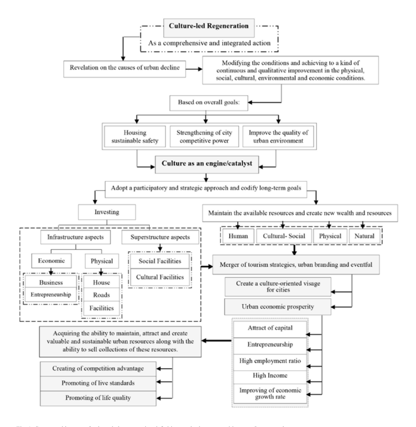
Fig.\ 1.\ Conceptual\ harvest\ of\ culture-led\ regeneration\ definitions\ and\ urban\ competitiveness.\ Source:\ authors.

by improving physical quality and reviving local life, it can have social output as well. Certainly, in order to achieve this goal, precise planning for the creation and exploitation of clusters and cultural infrastructures along with high tech industries is needed.