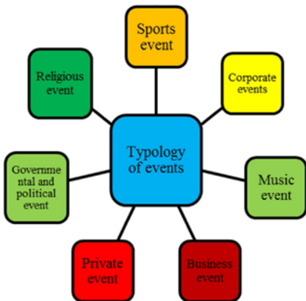
Fig. 1. Typology of events.

anniversaries.” In fact, religious events, for people who have dominated religious motives and desire also those who are interested in the cultural aspects of the religious event, are considered a powerful attraction. In these events, contributors are more intervener than a spectator. Getz (2005) considers religious events as a kind of planned event and a subcategory of cultural events. Raj, Walters & Rashid (2013) offers an additional typology of events and, as shown in Figure 1, places religious events in a separate category (Fig. 1). Such a separation indicates that religious ceremonies require a particular management and experience of religious tourism (Cerutti & Piva 2015).