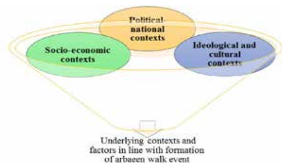
Fig. 2. Underlying contexts and factors in line with formation of Arba'een walk event.

In general, the main incentives and backgrounds of the creation of the Arba'een mega event can be summarized as follows (Fig. 2):