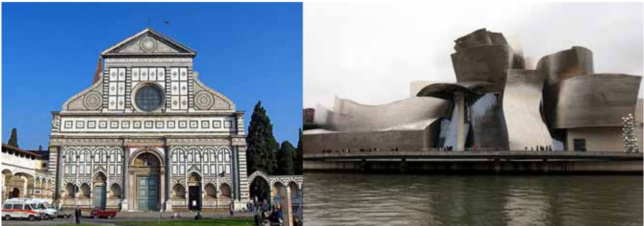
Fig. 7. one of the most important capabilities of architecture is the generation of component unifying metaphors. Left: Santa Maria Novella by Leon Battista Alberti (wikipedia.org) designed based on the relationship of whole and part; and right: Guggenheim Museum Bilbao by Frank Gehry (archdaily.com) and challenging the traditional concept of composition.