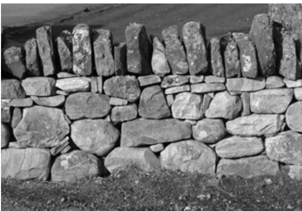
Fig. 1. Embodied order, the condition for the appearance of primary spatial metaphors.

wouldn't be possible without the presence of these components.