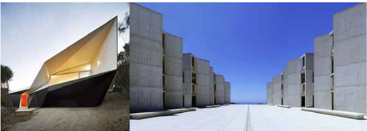
Fig. 5. Architecture provides different concepts of enclosure. Left: Klein Bottle House by McBride Charles Ryan (dezeen.com) which was designed based on the characteristics of Klein Bottle and negates the concepts of inside and outside; and right: Salk Institute by Louis Kahn using the common concept of enclosure. Source: www.archdaily.com.