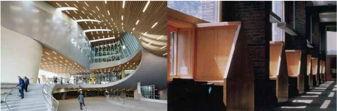
Fig. 4. Perception of time becomes possible for humans through metaphor. Different capabilities in the relationship between motion and advancement in location and metaphORIZATION. Left: Arnheim Central Transfer Terminal by UNStudio (architectmagazine.com); and right: Phillips Exeter Academy Library by Louis Kahn. Source: Wiggins, 1997: 20.

through repetition of our behavior in space or through innovation in our behavior can unconsciously create primary metaphors or give them weight or even change them (Fig. 4, 5, 6, 7). Moreover, by accepting architecture as the third skin (Hendershott, 2013: 52) and as an extension of the body, everybody-oriented metaphor, affected by this extension, can change. It should be noted that the third skin and even the general idea of this discussion can be outlined and understood in a metaphorical system.