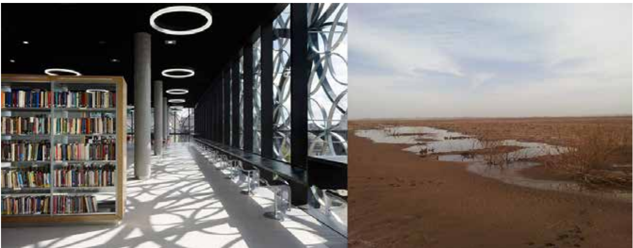
Fig. 2. Architecture is an array of all that emerges only with the help of architecture. Left: Library of Birmingham by Mecanoo (dezeen.com), an artificial array which is an instance of what Schulz said: Every meaning necessarily emerges in a specific location and this emergence determines the character of that location. Right: Lut Desert, a natural array. Photo: Marjouei, 2017.

Since architecture is an array of volumes, objects, lights, shadows, sounds, spaces, views, colors, textures, patterns and whatever else that takes form and order through architecture, then it acts as an exogram (Fig. 2). In an article titled Exograms and Interdisciplinarity: History, the Extended Mind, and the Civilizing Process , John Sutton states that the theatre stage is not just for play but it’s a cognitive map for the progression of the play (Menary, 2010a: 202). And this can be generalized to architectural space and any creation of mankind and similarly, he considers the civilizing process as the process of ordering and arraying our minds and behaviors which is necessarily realized through external arrays and sharing of the information (exograms). Cognitive archaeology is the reverse path that John Onians travels in the field of architecture and examines architecture as the tool for analyzing the brains of the people of past civilizations. For example, he uses this method in the article Greek Temple and Greek Brain, Body and Building (Onians, 2002: 44-63) and concludes that compared to the ancient Greeks, we have a different configuration in our nervous system because we live