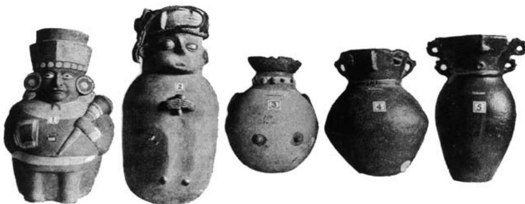
Fig. 3. Peruvian jars from the Pitt Rivers Collection representing the fundamental metaphor of container, influenced by the human body as container and the evolving to more functional forms over time.

The container schema (Fig. 3) is one of the most fundamental schemas with which we conceptualize many of our activities. We constantly feel our bodies as containers and as stuff being in the container (Lakoff, 1990). The container metaphor is metaphorical externalism which contains the concepts of boundary, inside and outside within its topological structure (Malafouris, 2013) and thus direction (outward or inward), as well as distance (being far from or near the boundary or center), is also conceptualized. Architecture, as the third skin (the first skin being the biological skin and the second skin being our clothes), gains this particular ability (i.e. distinction between inside and outside) primarily by accepting the container metaphor and secondly by limiting the building of vision and sound within its boundaries which are both directly related to our sensory-motor abilities.