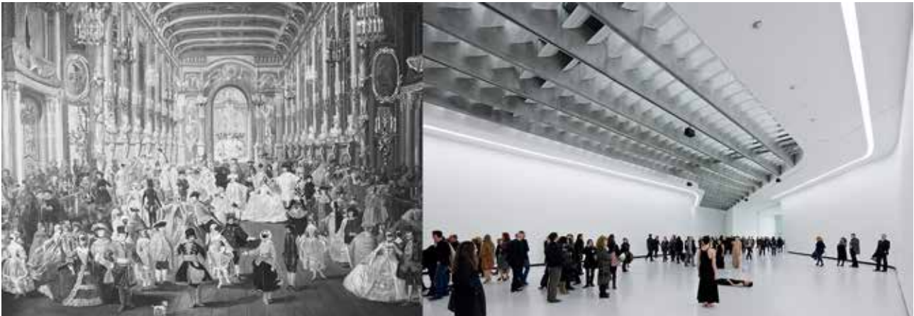
Fig. 6. Some human behaviors manifest in places with special characteristics. Left: engraving of Ball masque dance in Court Theatre in Bonn, Germany, during Baroque period (Soergel, 2005: 77); and right: MAXXI Museum by Zaha Hadid (dexigner.com), an environment for post-human behaviors. Source: www.dexigner.com.