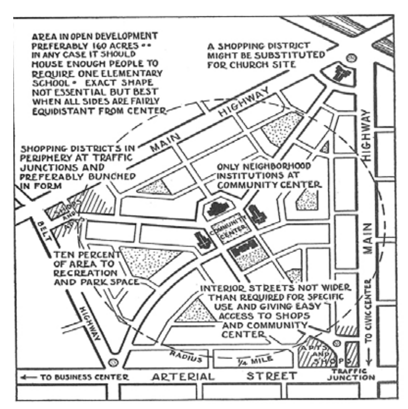
Fig. 1. Neighborhood unit diagram.