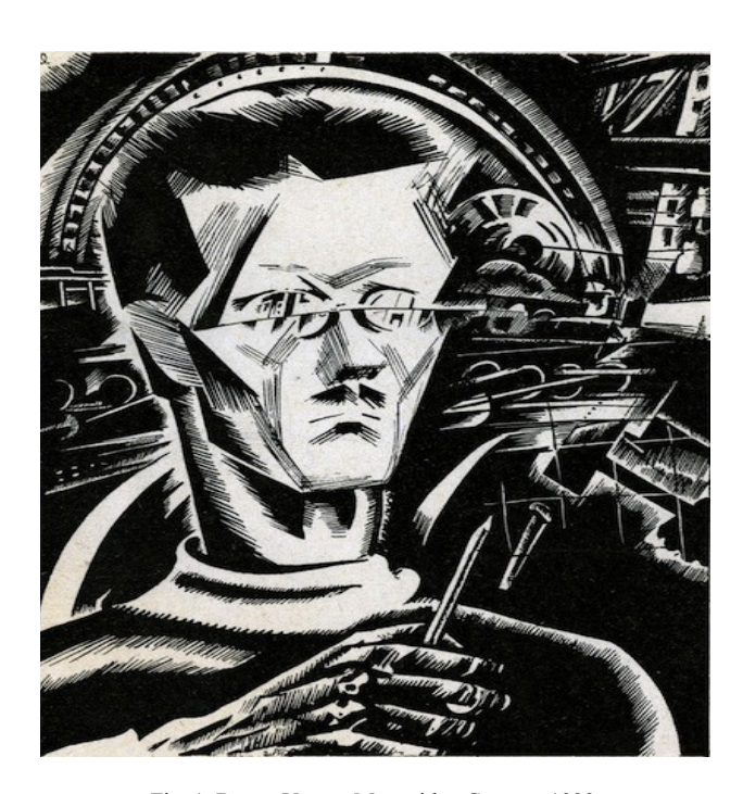
Fig. 1. Dzyga Vertov, Man with a Camera, 1929. Source: Museum of Contemporary Art in New York. www.moma.org

With the Communist-Marxist revolution that led capitalist's to lose power, the machine, which previously caused worker's exploitation and self-