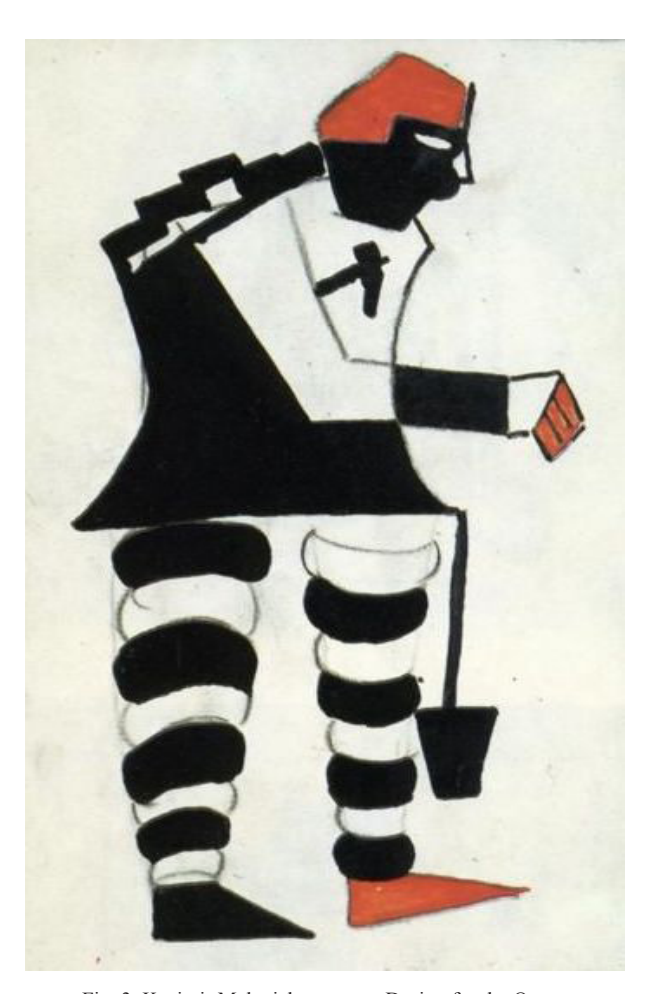
Fig. 3. Kazimir Malevich, costume Design for the Opera Victory Over the Sun, 1913.

the opera of "Victory over the Sun"18 which was performed in St. Petersburg Luna park in 1913 and audiences showed such an intense reaction to the extent that there was chaos and uproar, in its only two performances. Interestingly, until the art of social realism in the Stalinist Russia, this opera was remembered as a revolutionary art masterpiece<sup>19</sup>. It is said about this opera that: "the first highly organized, multimedia performance that was also the most notorious which billed as the first futurist spectacle in the world" (Salter, 2010:11). The opera was composed of futuristic poems<sup>20</sup> by Khlebnikov<sup>21</sup> and Alexei Kruchenyk<sup>22</sup>, setting and costumes by the painter Kazimir Malevich and music- including strident and strange noises- by Mikhail Matyushin<sup>23</sup>; a mixture of artists, most of them came together with a common purpose.