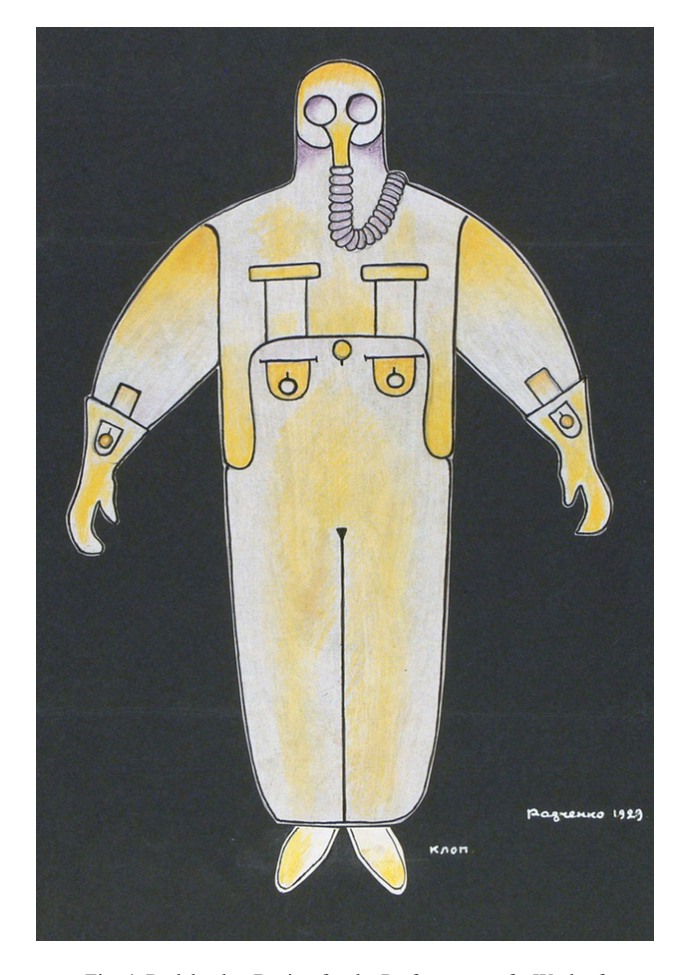
Fig. 4. Rodchenko, Design for the Performance of a Work of Mayakovski, Themed Freezing a Hero to Achieve a Communist Utopia, 1929.

This opera which ends with displaying an aircraft's crash into the scene, shows a group of strong men (futurists) who steal the sun and imprison it, in a sealed box to abolish past traditions, and "finally travel somewhere that despite extreme disorientation it is easier to breath" (Buck, 2000: 7). It is no accident that Marx states:" if the new forces of society (industry and technology) are supposed to work properly, they need only new men who command them". (Marx qtd. In lifshitz, 2007: 166). Also in 1929, Rodchenko who was responsible for designing the costumes for the performance of a work by Mayakovski used a pattern similar to iron man, to depict a hero who is waiting for a communist utopia. Apartfromthe"themeofthetriumphoftechnologyover natureandmodernmanoverthesun" (Lynton, 2005:93), is not the stimulation of the community to protest