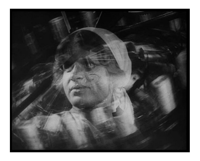
Fig. 2. Alexi Gastev, Machine Prophet, 1923.

Alexi Gastev<sup>16</sup>16, the futurist poet who was a blacksmith and political anarchist before the war, "with passionate enthusiasm described the new industrial machine as an animate force" (Buck, 2000: 7). Gastev, reputed as the prophet of mechanized man and the poet of the machine, wrote in 1919: "an epoch, the like of which has never been since the creation