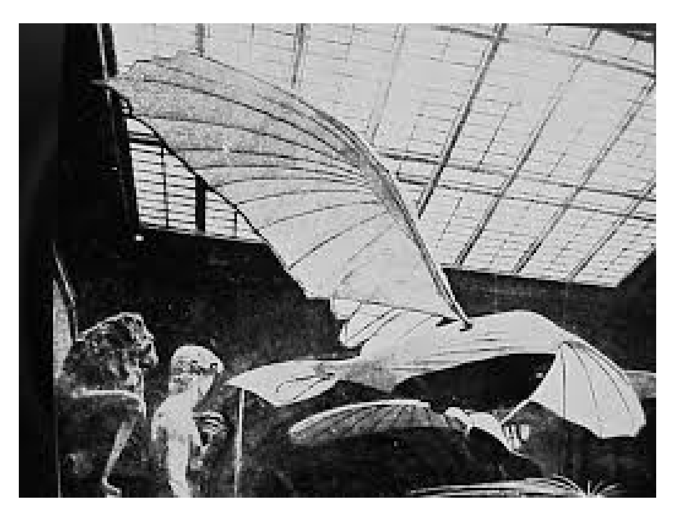
Fig. 7. Vladimir tatlin, the model of "letatlin", 1923.

Since Russia's new government had focused on fast production and construction, it drew its attention to technology<sup>35</sup>, but in the field of art, and particularly during Stalin's age, the government preferred to put the task of propangnda and of reflecting the