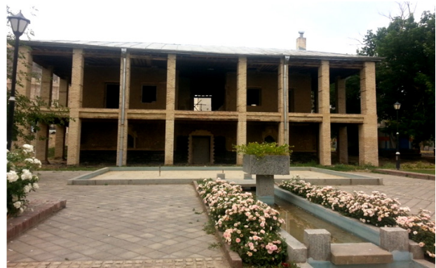
Fig. 8. A mansion South elevation of Americans' home garden.