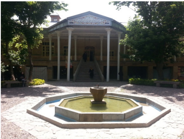
Fig. 3. A view of west elevation and the entrance portal in Nazari garden.