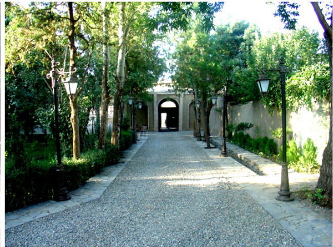
Fig. 4. A view of west elevation and the entrance portal in Nazari garden.