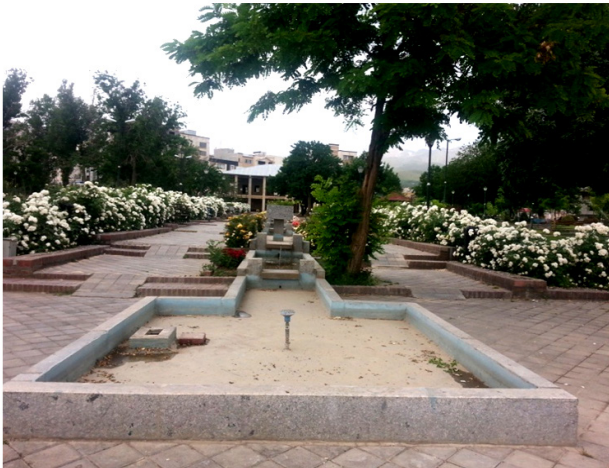
Fig. 7. Water axis front mansion of Americans' home garden.

The pavilion reconstruction is in progress. Results of materials collected by catalogues of garden based on inventorying and documenting are shown in Table 2.