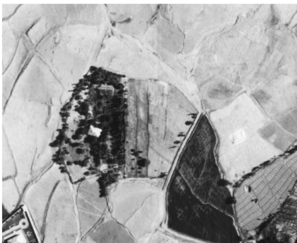
Fig 6. The location of Americans' home garden in an aerial photograph of year 1335.

the order, plot and definition of the axes of motion has changed a lot and its restoration has been done on the basis of the status quo.(Fig 8).