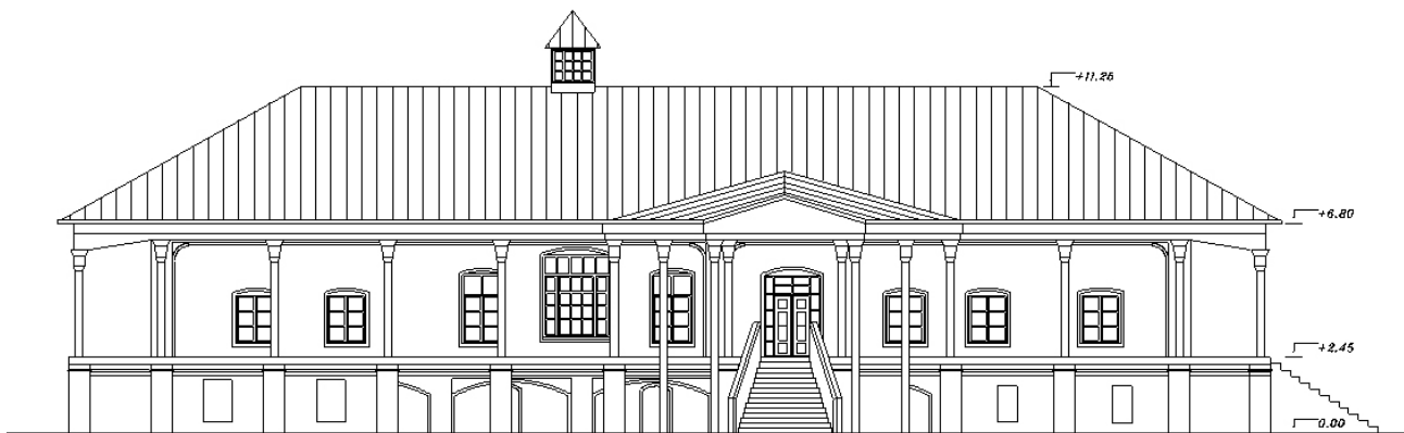
Fig. 2. The western elevation of the Nazari Garden mansion in Hamadan.