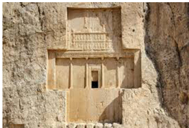
Fig. 9. Chalipa symbol, the tomb of the Achaemenid kings. Susa,Source: Bakhturtash, 2007: 200