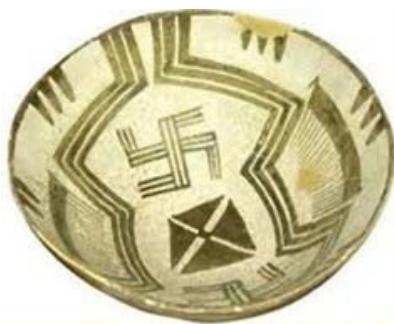
Fig. 2. Susa vessels with Chalipa.