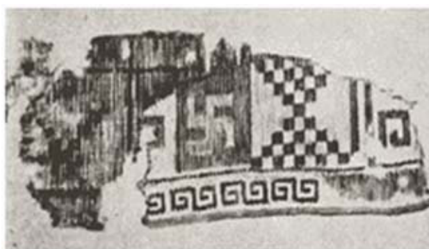
Fig. 4. Parthian fabrics with a figure of broken Chalipa, Germi Moghan.