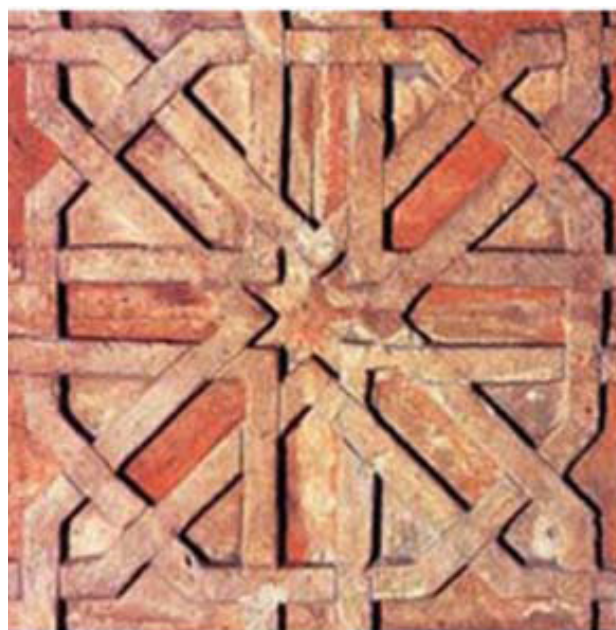
Fig. 5. Tiles from Samanid period The Metropolitan Museum.