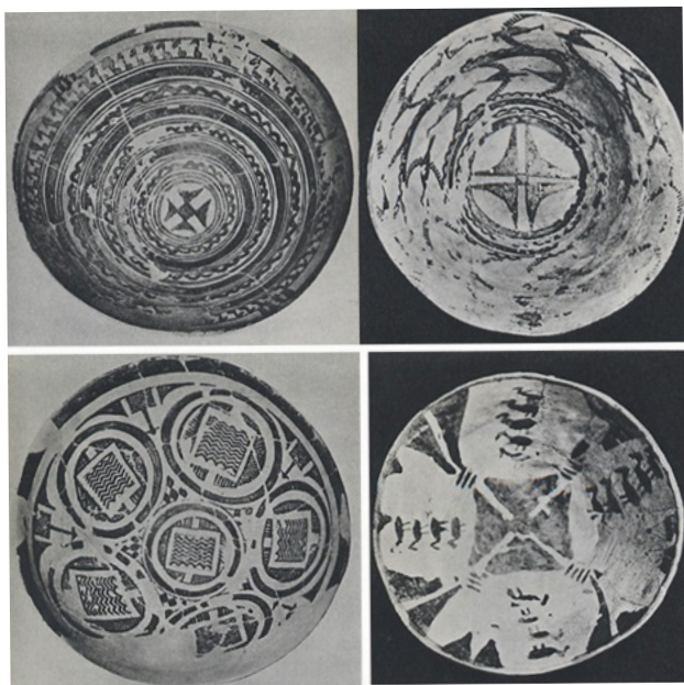
Fig. 8. Image of Chalipa on pottery in Susa.