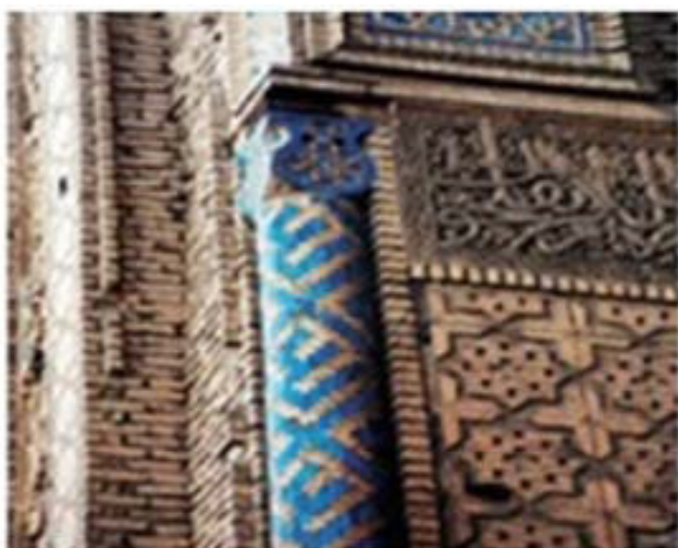
Fig. 6. Semnan Mosque designs halls image Mogharnas.