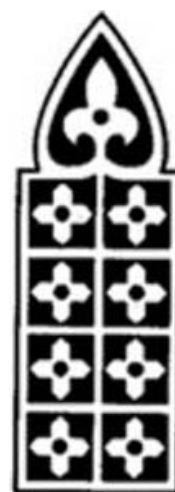
Fig.7. Mogharnas relief of corridors, entrence. Aljaytou, Bastam Complex.