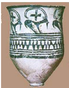
Fig. 1. Sialk vessels with Chalipa.