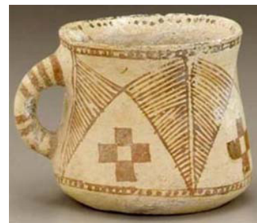
Fig. 3. 3,000-year-old cup with Chalipa figure on it the whereabouts, Smithsonian Museum.