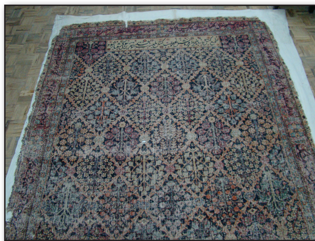
Fig. 1. The context of the dedicated carpet.

Message analysis: The message content is instructive and the carpet has been dedicated. Having a legal and warning content, this carpet addresses the public and