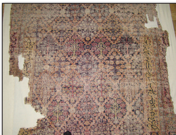
Fig. 3. The dedicated carpet context.