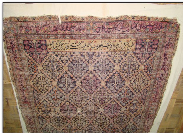
Fig. 2. The context of dedicated carpet.