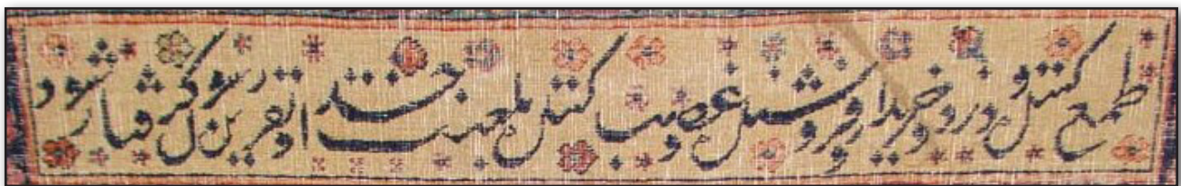
Fig. 4. Inscriptions of four peripheral frames of the carpet.

opposes any negative thoughts about the carpet so that the offender will be reminded of the warning and finds no justification for its law-infringing act. Explicit layers indicate that any greedy person thinking about stealing, buying, selling or usurping the property will suffer the curse of Allah and His Messenger. The word dedication or endowment means conservation and keeping of an exact belongings to be used in will of God. Therefore, these belongings have no owner in the material world and no person has the right to buy, sell, steal or possess the property under any circumstance. The location where the message is inserted is in form of four rectangles on the four peripheral frames of the carpet context. These frames are located on the underlying diamond network and have infringed the independence of the carpet background. This arrangement is designed to emphasize on the significance of written texts and convey the message to all addressees since