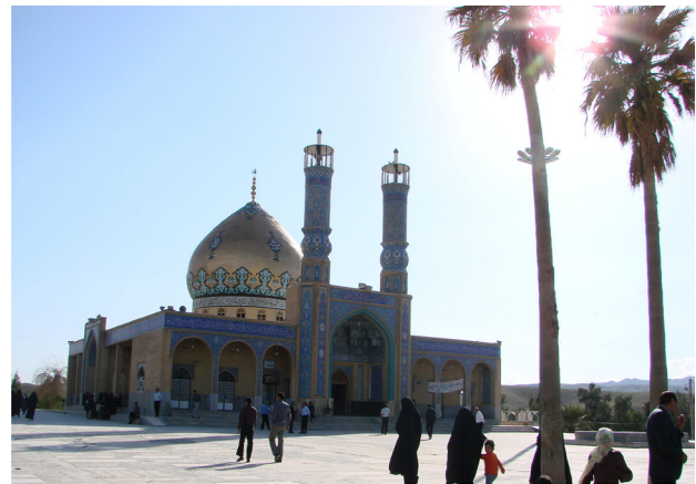
Fig. 3. Ali- Alsaleh shrine- current building.

are capable of shaping and strengthen elements and processes associated urban development. Saleh Abad benefits from religious potentials for its being located near a holy shrine. In other words, the shrine is the strongest potential of the town (Saleh Abad conducting plan, 1385: 48). In the following the architectural history of the shrine is introduced and its urban elements are expressed.