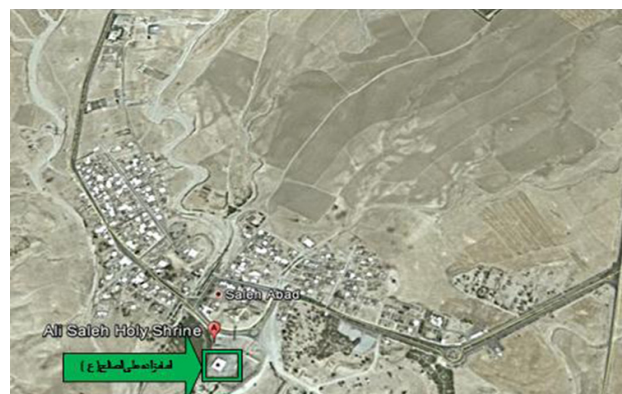
Fig. 1. The situation of Ali- Alsaleh shrine in Saleh abad city.

Islamic city can be divided to physical components including the city structure and spatial components comprising space and city spirit (Cultural studies of Saleh Abad Research, 2011:61). Saleh Abad lacks an Islamic urban physic while benefiting from an Islamic space and atmosphere due to the existence of Ali Al-Saleh shrine. The significance of the city according to the contemporary construction of the city, can be identified as the continued functioning of the shrine and its spiritual role in the formation of new cities. In other words, even today religious element