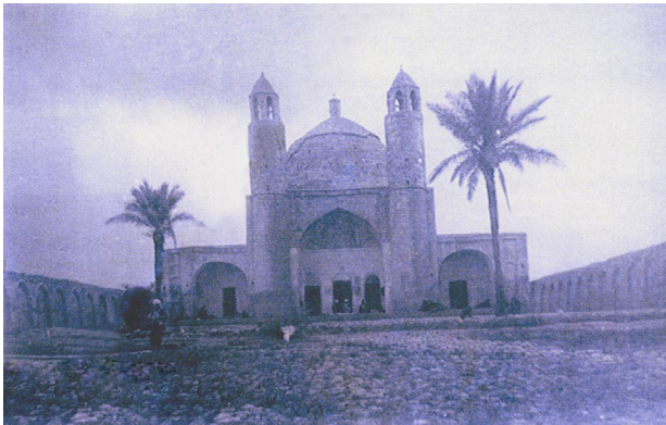
Fig. 2. Old picture of Ali- Alsaleh shrine.