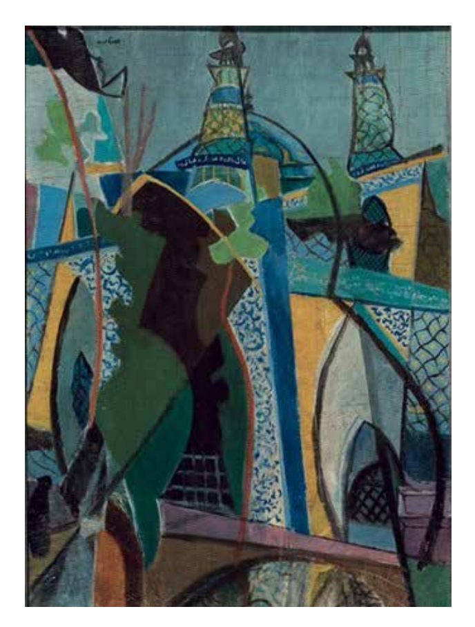
Fig. 2. JalilZiapour. "The Sepahsalar Mosque". - Cubist tendency of Jalil Ziapour.