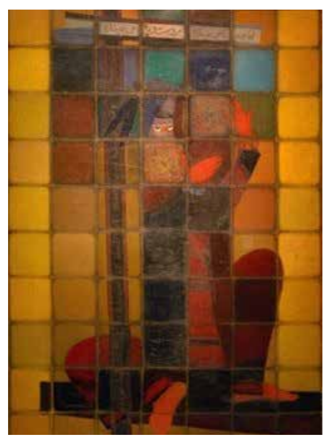
Fig. 4. JalilZiapour.1963. " My man is binding Hina".