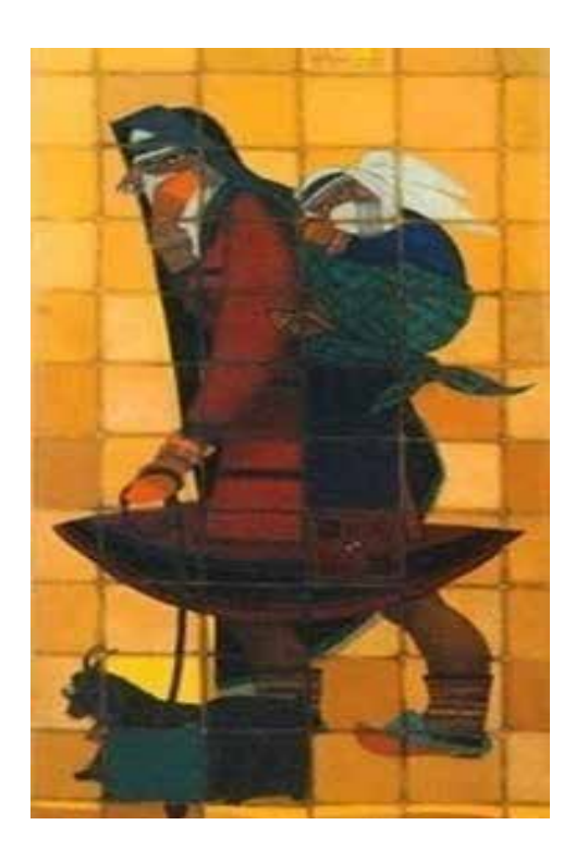
Fig. 3. JalilZiapour.1953."A Kurdish woman from Quchan".