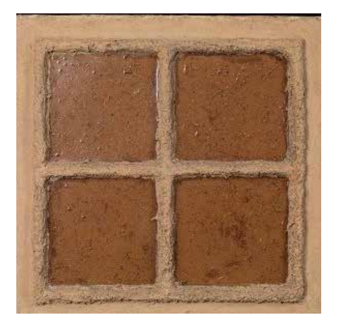
Fig. 6. Marcos Grigorian. 1974."Four in one".