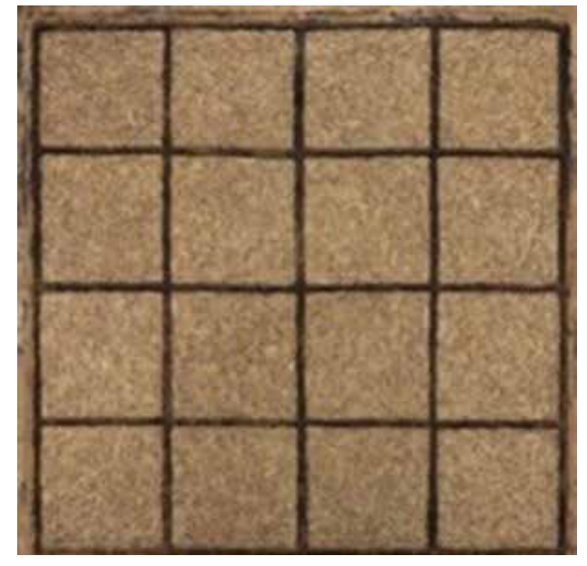
Fig. 7. Marcos Grigorian . 1979. "Earthwork".