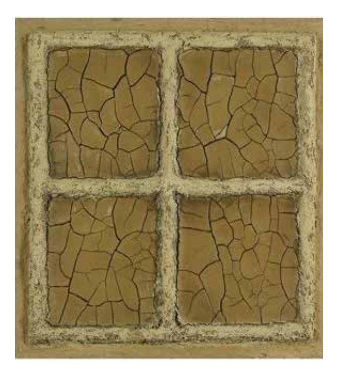
Fig. 8. Marcos Grigorian . 1965. "Earthwork".

Jalil Ziapour has continued to use the medium of oil painting on the canvas to create indigenous figurative backgrounds, while breaking away from the pictorial traditions of Kamal-ol-Molk's. Marcos Grigorian, but, with the cob backgrounds-that is a kind of Iranian vernacular material-has separated